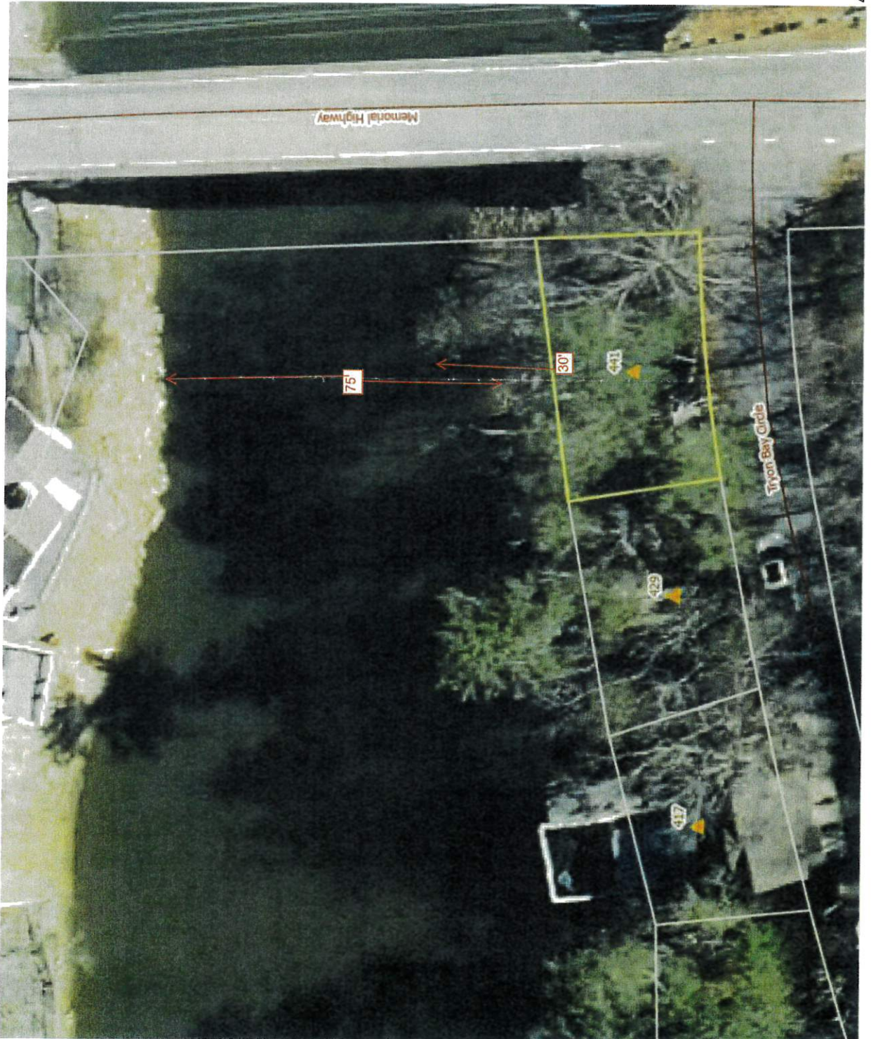
429 & 441 Tryon Bay Circle