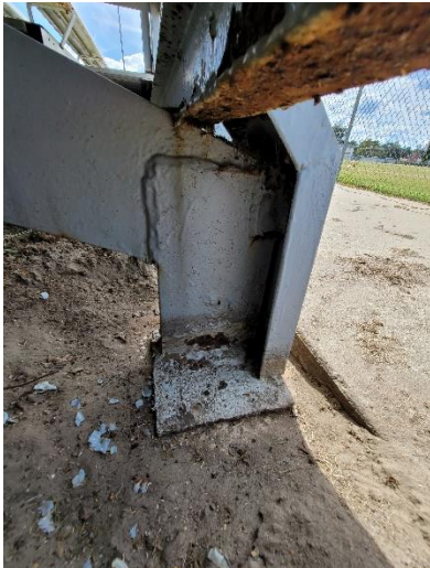
Column 1 - (6" channel) Active corrosion, pitting with 10% loss of section isolated in lower web only.