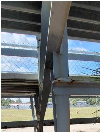
Column 2 - (H-pile) Overall section loss less than 5% in lower 2". The Northwest flange has been removed (flame cut).