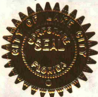
Seal of the City of Lake City State of Florida

NOW, THEREFORE, I, Stephen M. Witt, Mayor of the City of Lake City, Florida, do hereby extend the State of Emergency due to the COVID-19 health concerns for an additional seven (7) days effective December 8, 2020.