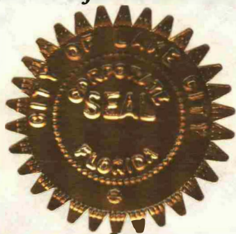
Seal of the City of Lake City State of Florida

NOW, THEREFORE, I, Stephen M. Witt, Mayor of the City of Lake City, Florida, do hereby extend the State of Emergency due to the COVID-19 health concerns for an additional seven (7) days effective December 15, 2020.