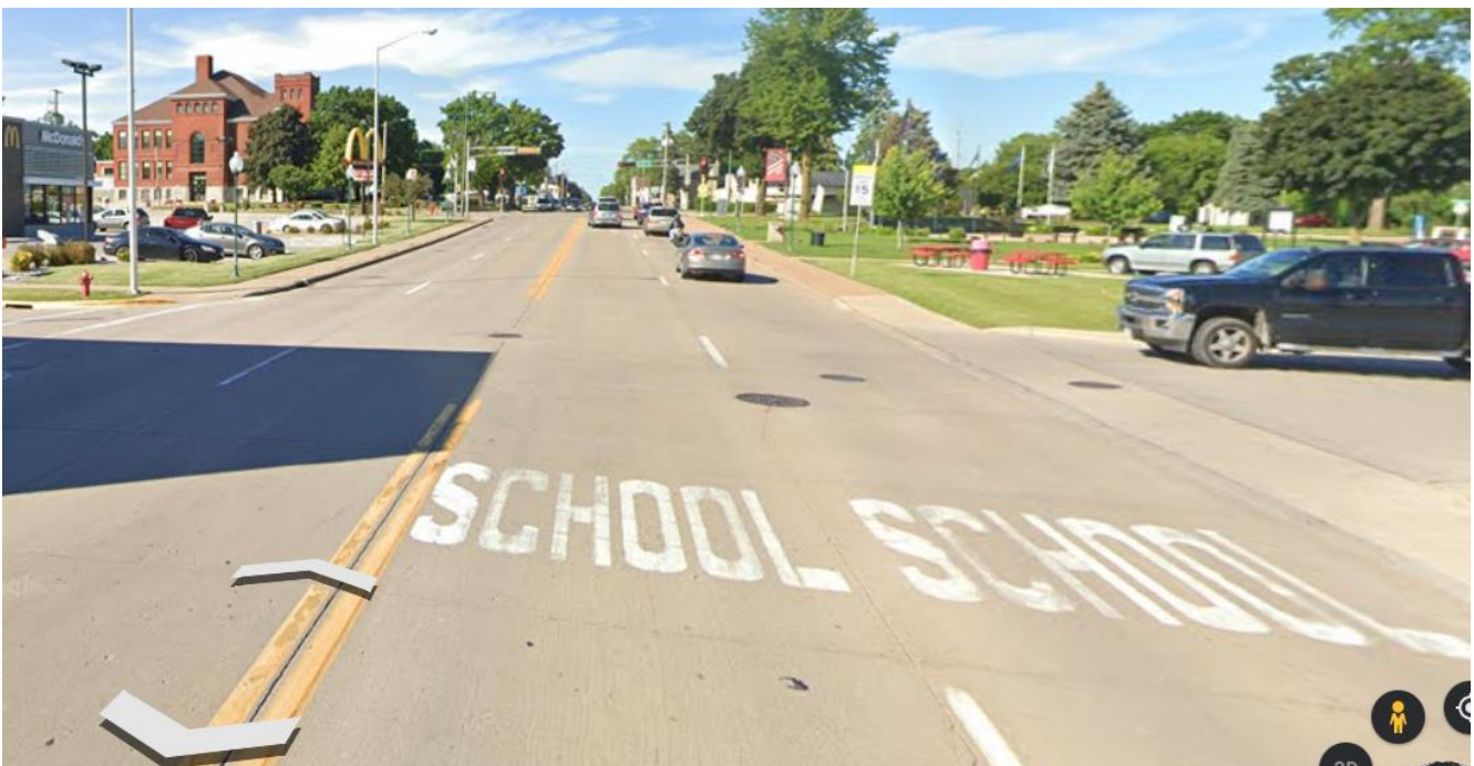
North Bound STH 55 – Existing Sign