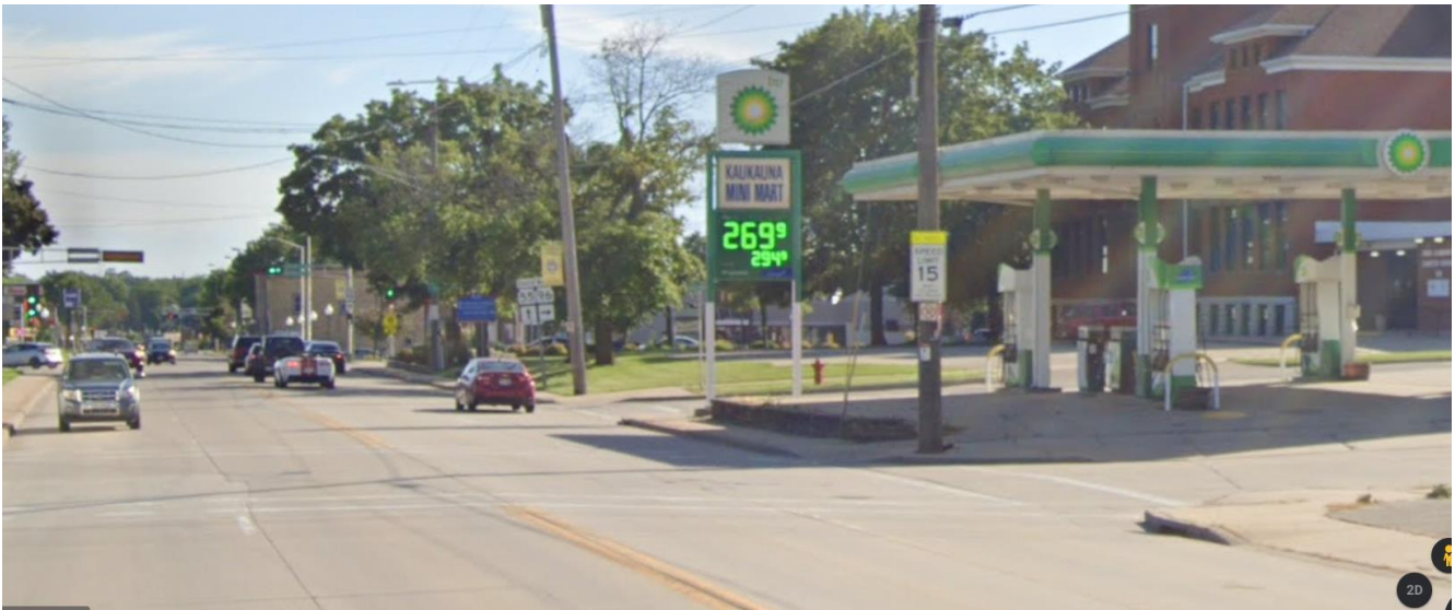
South Bound STH 55 – Existing Sign