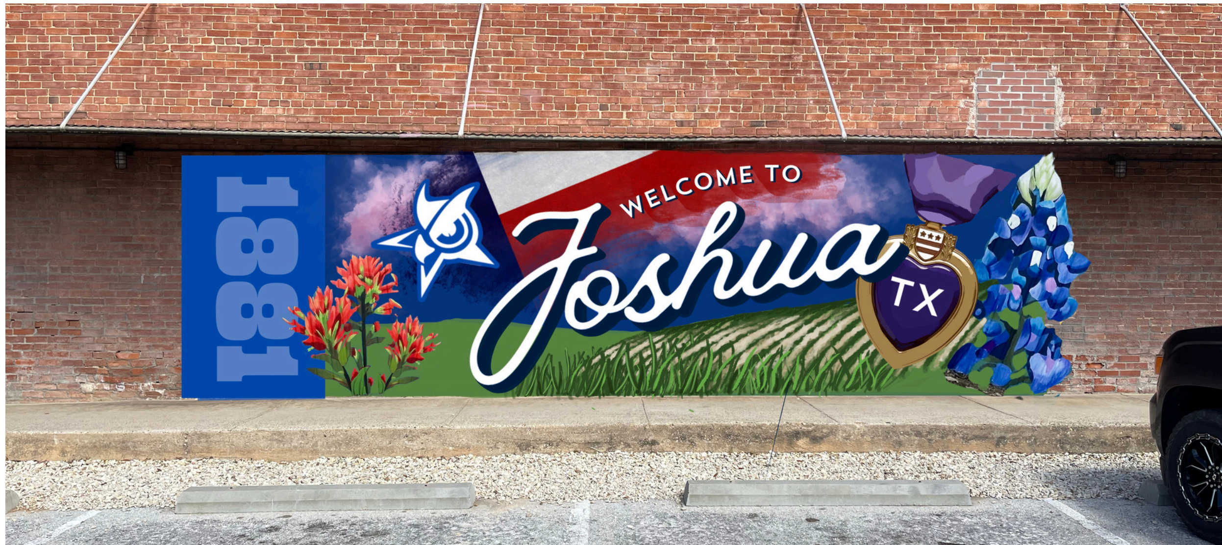
Handpainted Welcome to Joshua social media mural painted with exterior latex paints on brick wall. 7.5'x28'