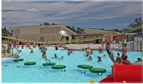
e. Shallow water play structure