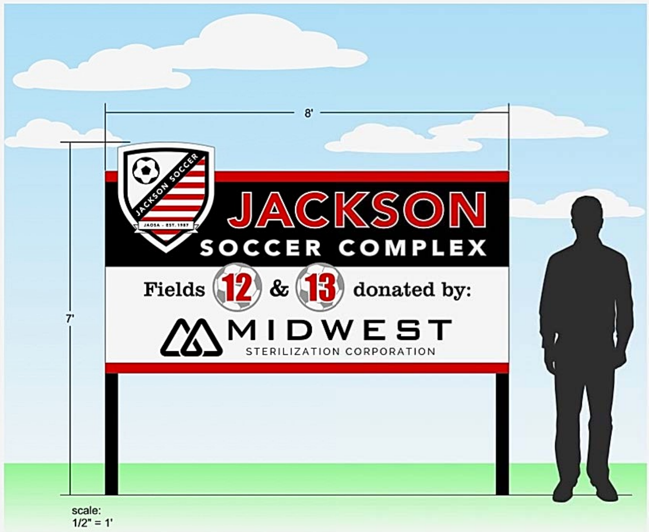
(1) SINGLE-SIDED, NON-ILLUMINATED SIGN