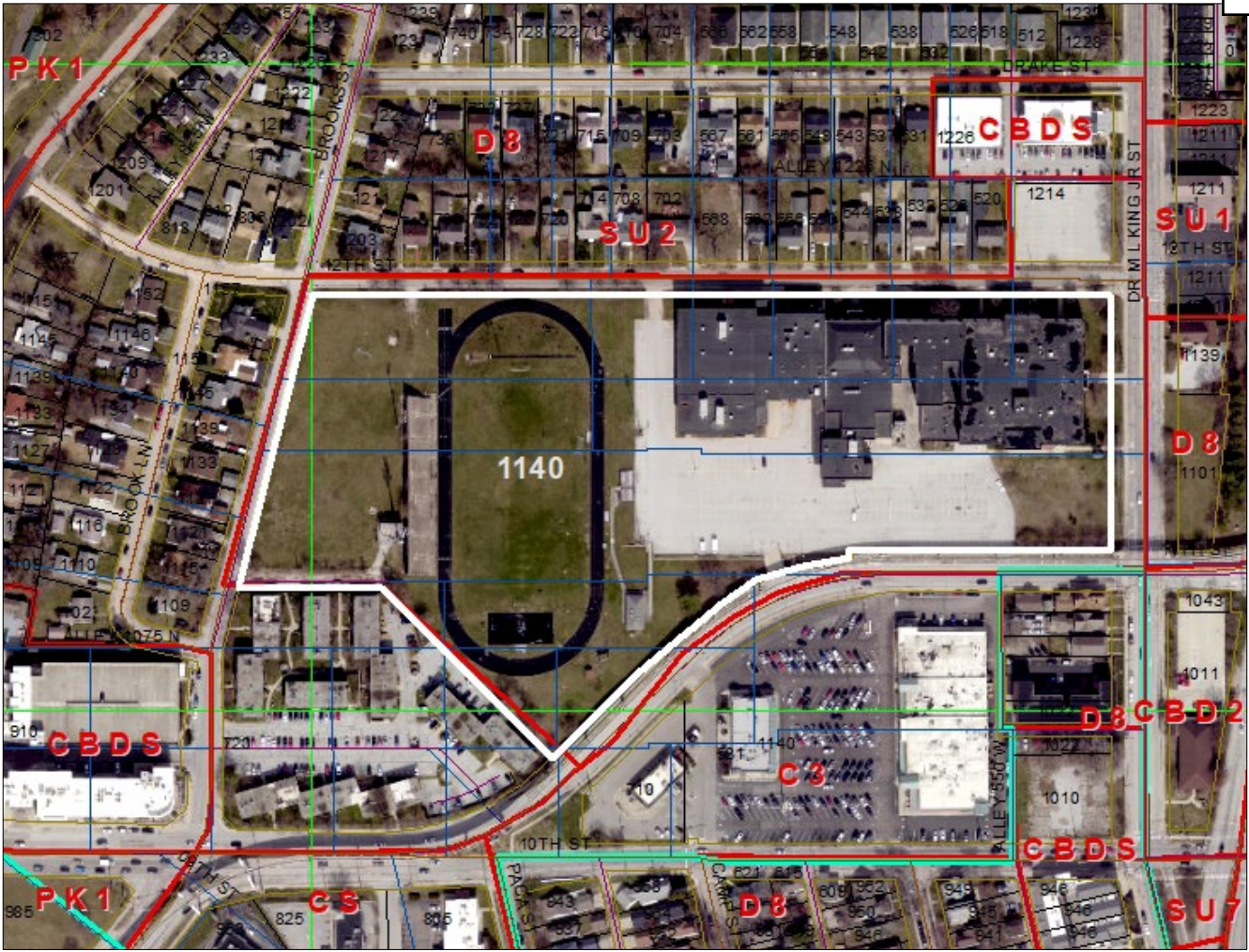
Aerial of site and surrounding area (top); site plan