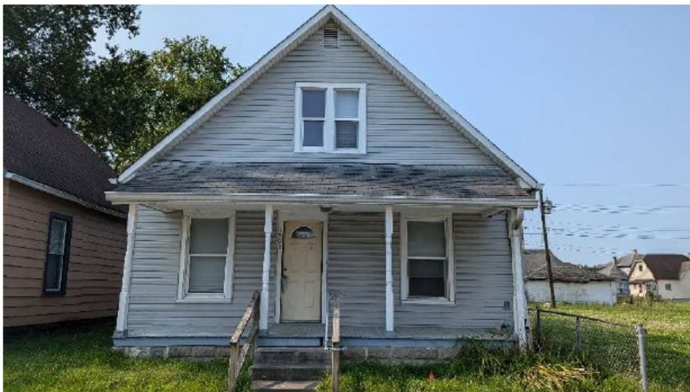
1505 Saulcy St Indianapolis