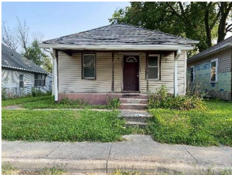
1504 Astor St. Indianapolis, IN.