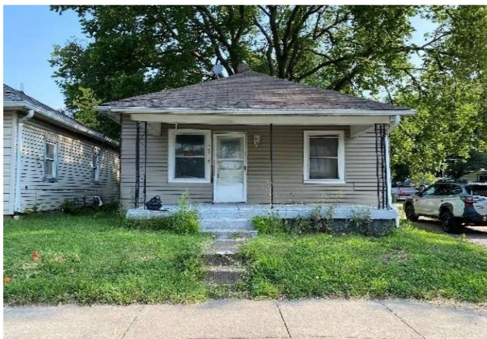
1502 Astor St. Indianapolis, IN.