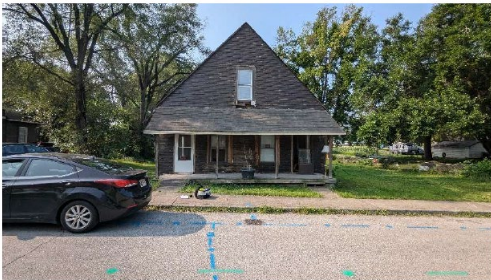
1443/1445 Saulcy St Indianapolis