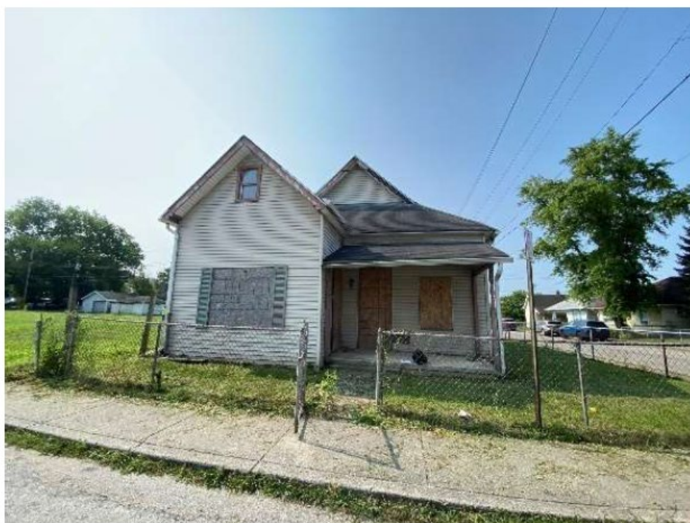
1533 Saulcy St. Indianapolis, IN.