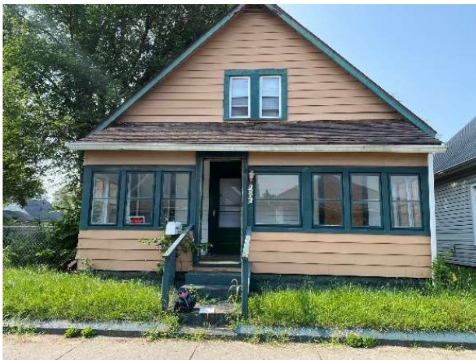
1501 Saulcy St. Indianapolis, IN.