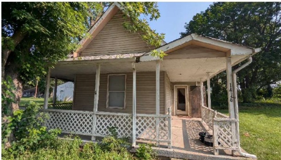
1436 Astor St Indianapolis