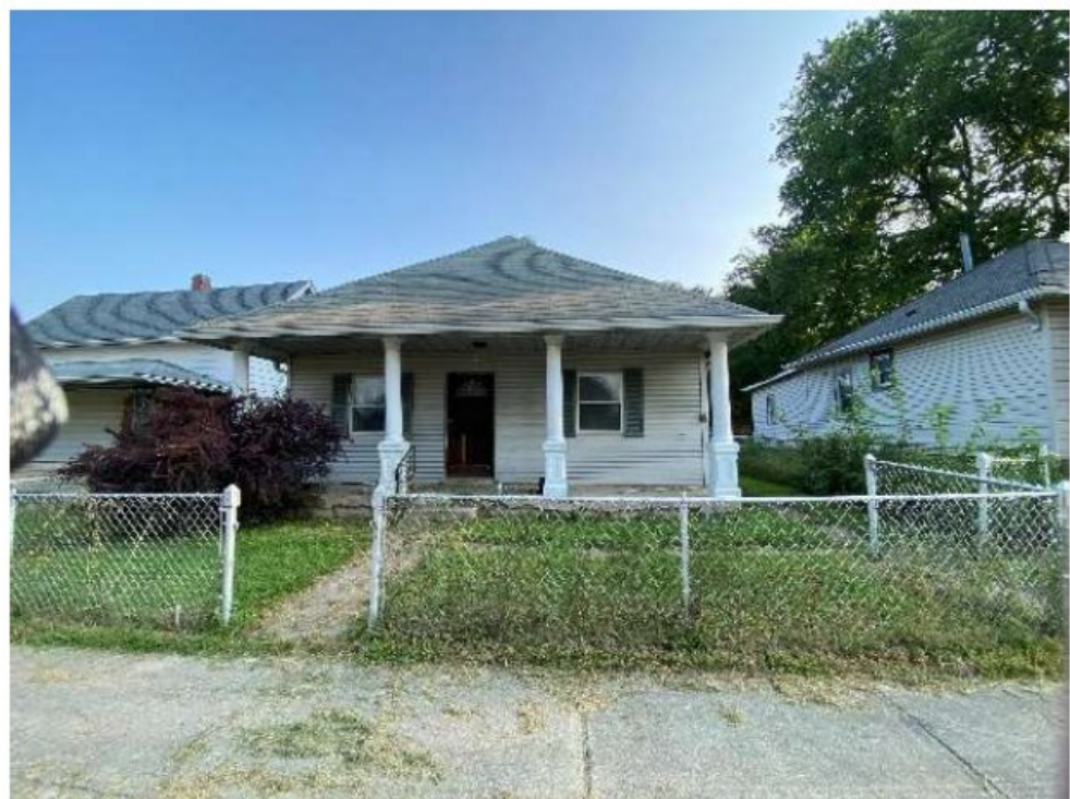
1506 Astor St. Indianapolis, IN.