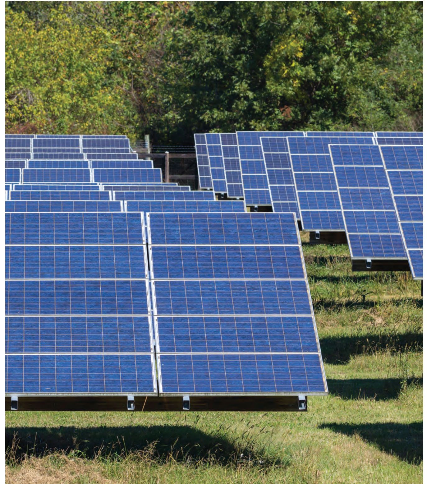
Solar panels