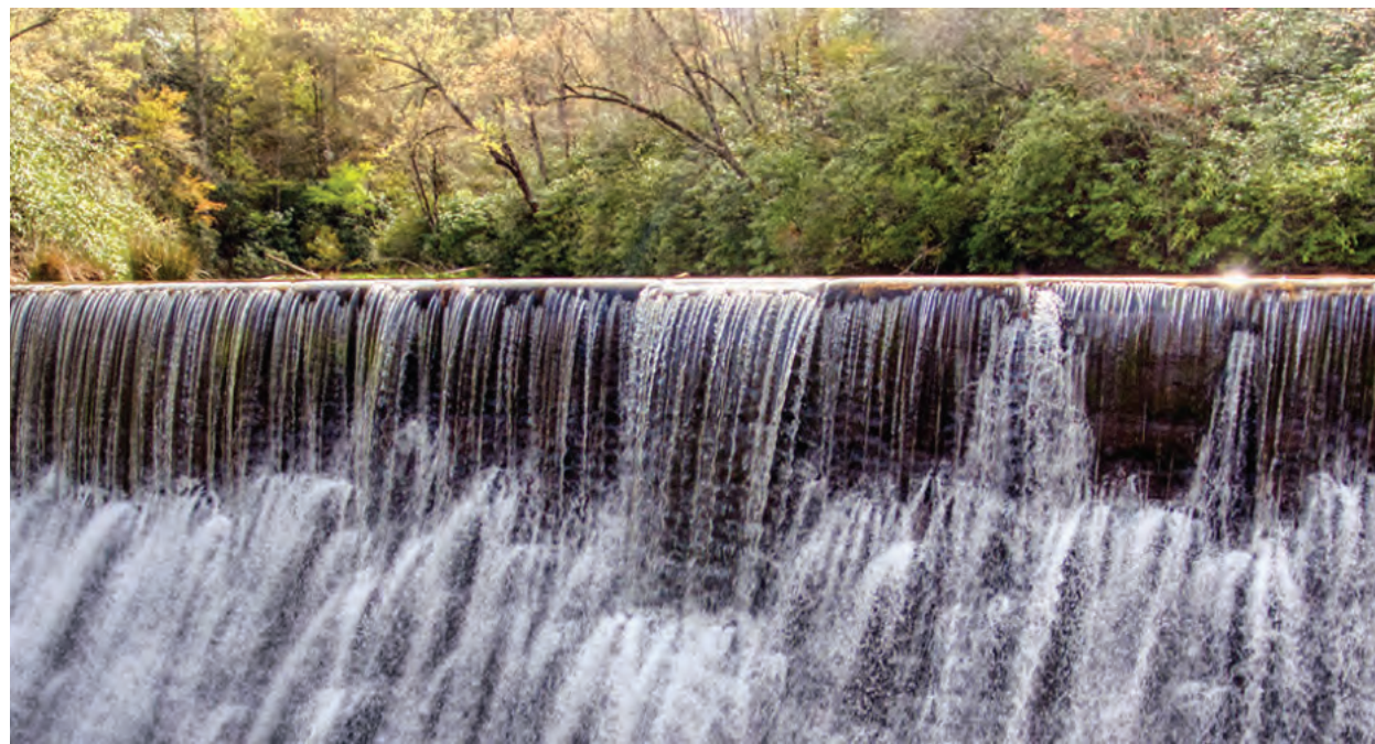
Hendersonville water supply

Fund priority utility and infrastructure projects to provide water, wastewater, and stormwater management services.