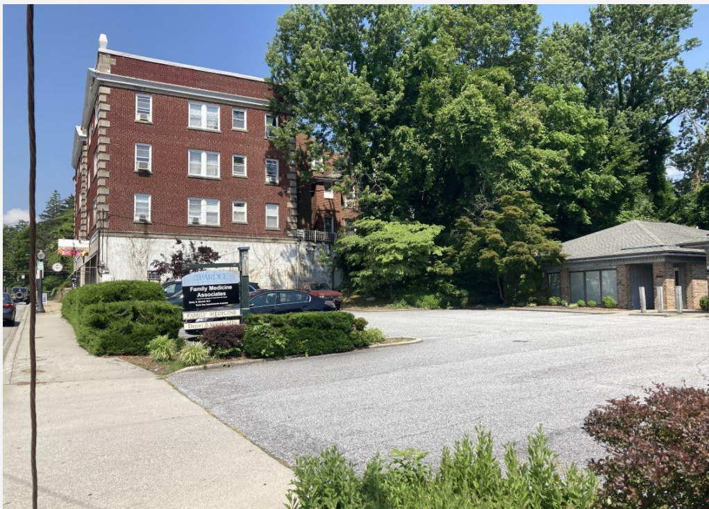
Contrast of setbacks: Mixed-use with multi-family apartments on upper floors and 0' setback (far) adjacent to medical office with parking in front and 65' front setback (near)