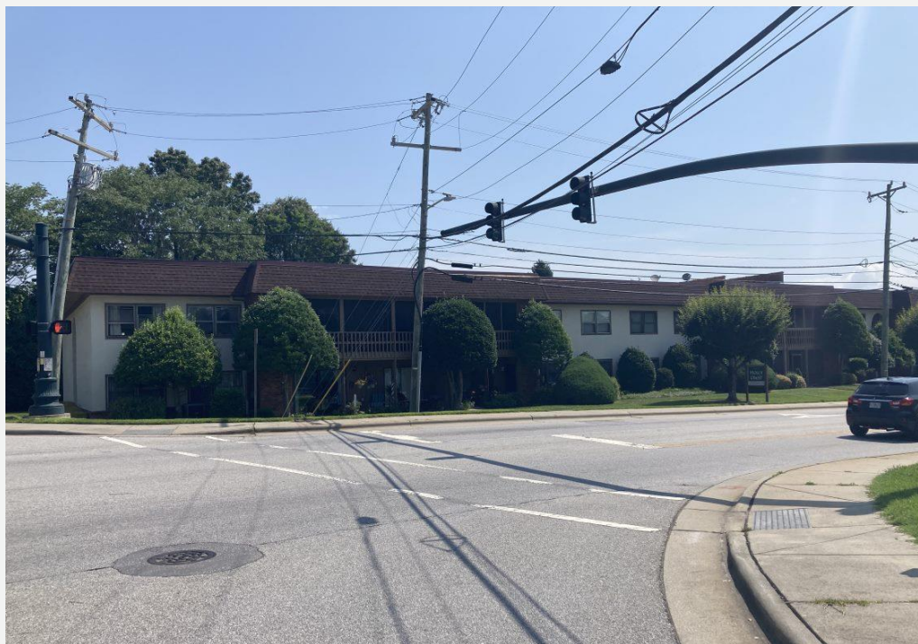
Multi-family on US 64 in the MIC