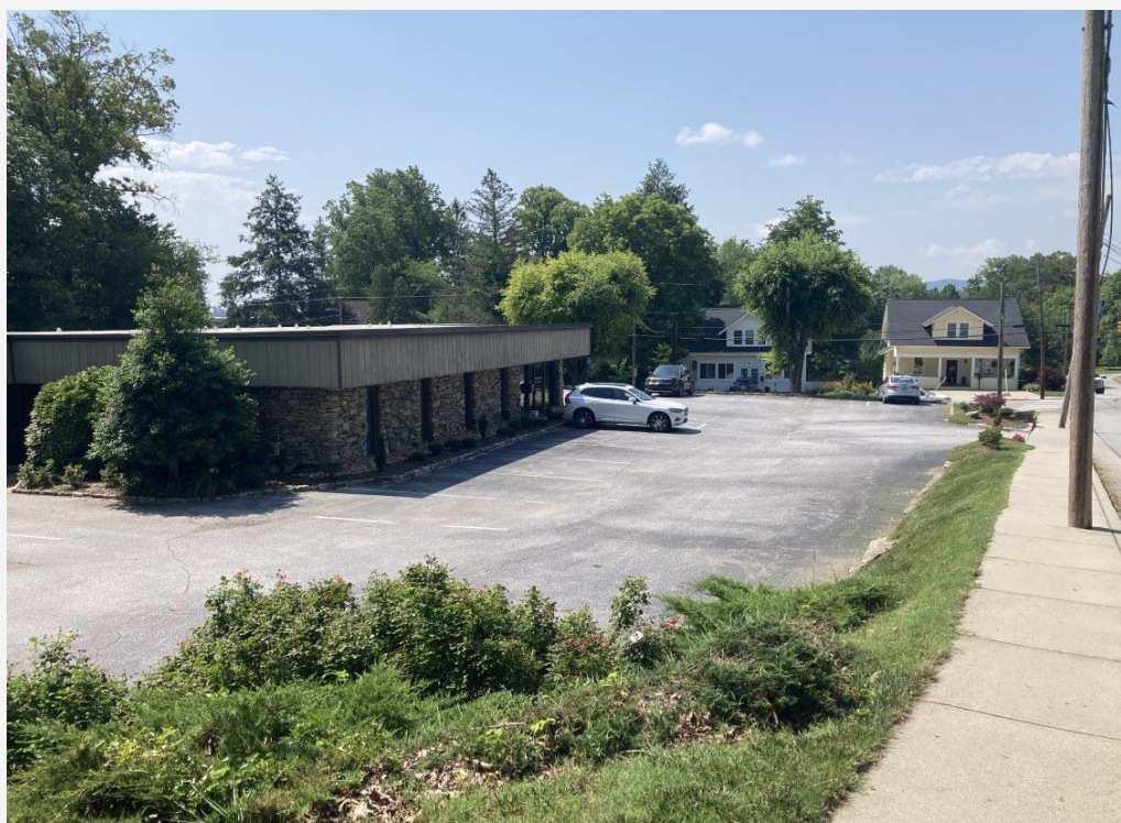
Conventional Suburban Development in MIC with parking in front and 50+' setback at Fleming St and 30' setback on 5 th Ave