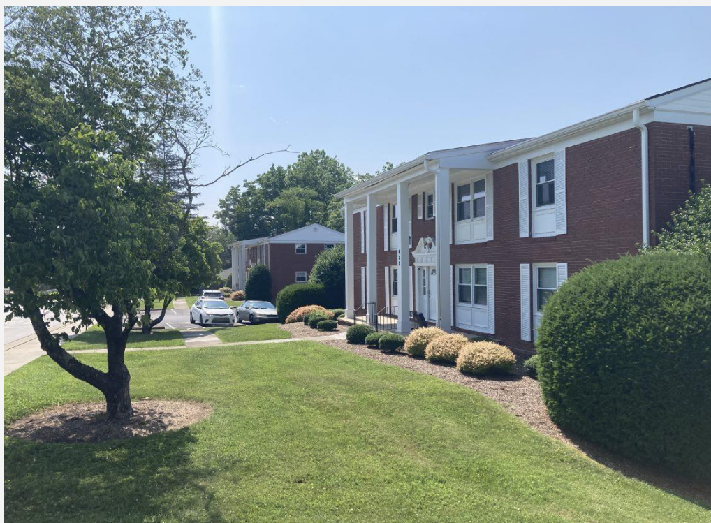
Multi-family on US 64 adjacent to MIC