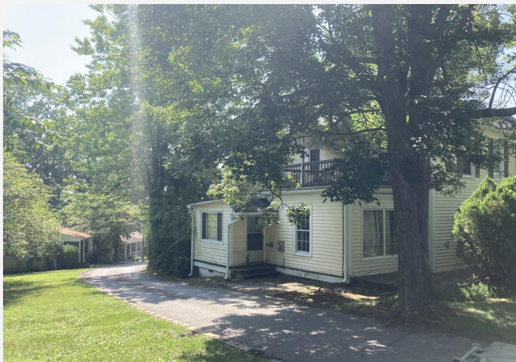
Multi-family in the MIC