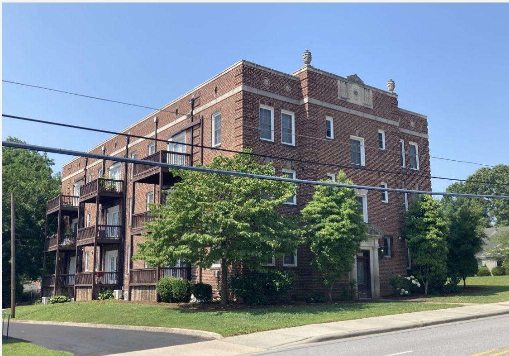
Traditional multi-family with 15' setback in the MIC