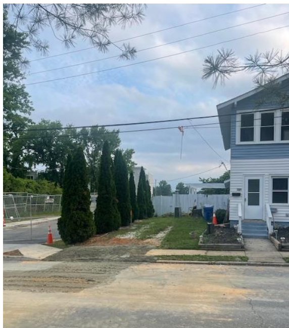
Side yard and view of adjacent properties driveway.