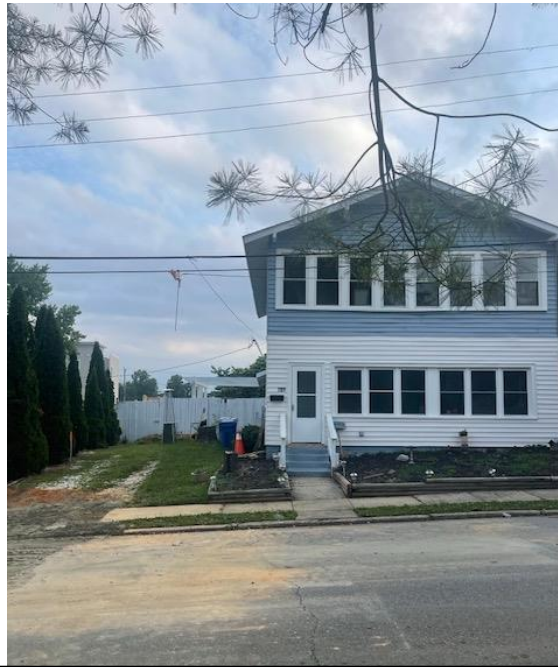
Front view of house and view of side yard where proposed addition would be constructed.