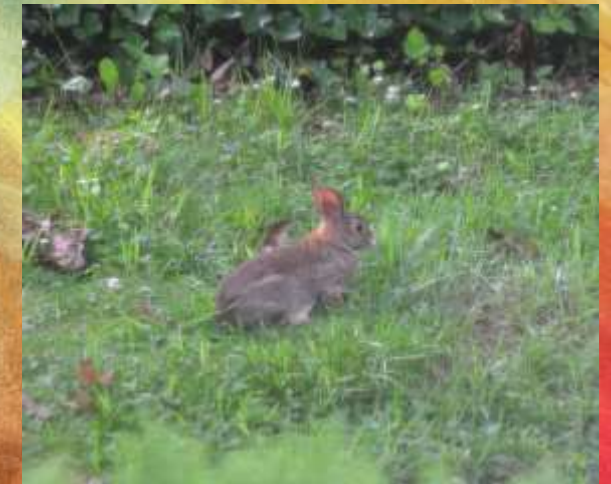
Chadwick Ave. Resident

→ Benefits of green infrastructure include: Enriched habitat and biodiversity - Reduced public infrastructure and service costs, including stormwater management and water treatment - Better connection to nature and sense of place.