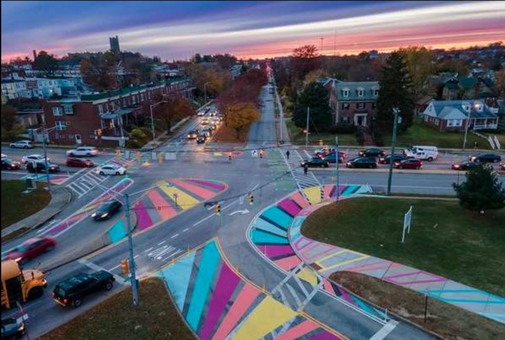
Example: Graham Projects Traffic Calming Crossings