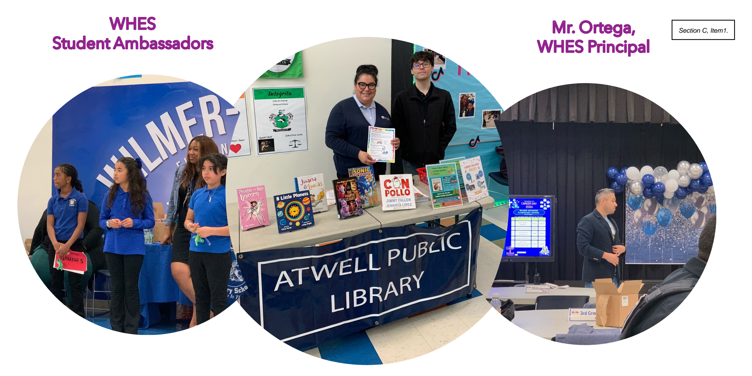
Presentations for 10 Classes - grades Pre-K through 1st Grade