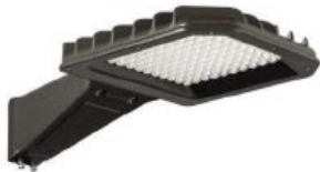
Scope of Work