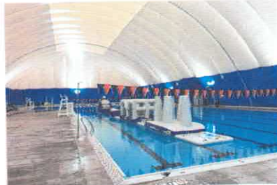
Pasco Memorial Pool – Photo courtesy Pasco Parks & Recreation Department