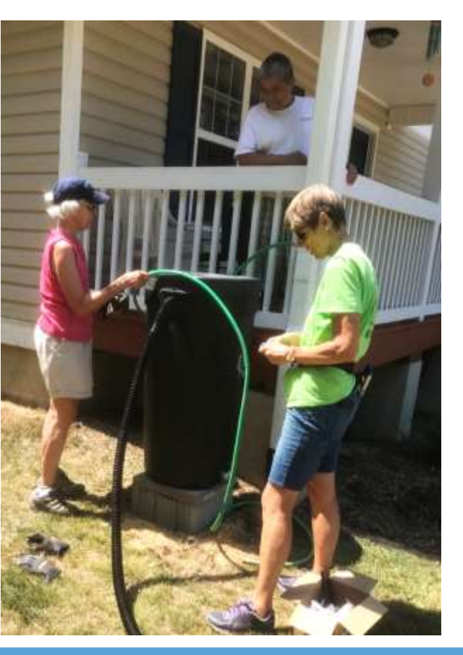
The Award-Winning Odie Street Stormwater Green Infrastructure Project

5 bioswales, 6 treatment swales, 6 check dams 20 rain barrels and 4,000 SF native plant gardens