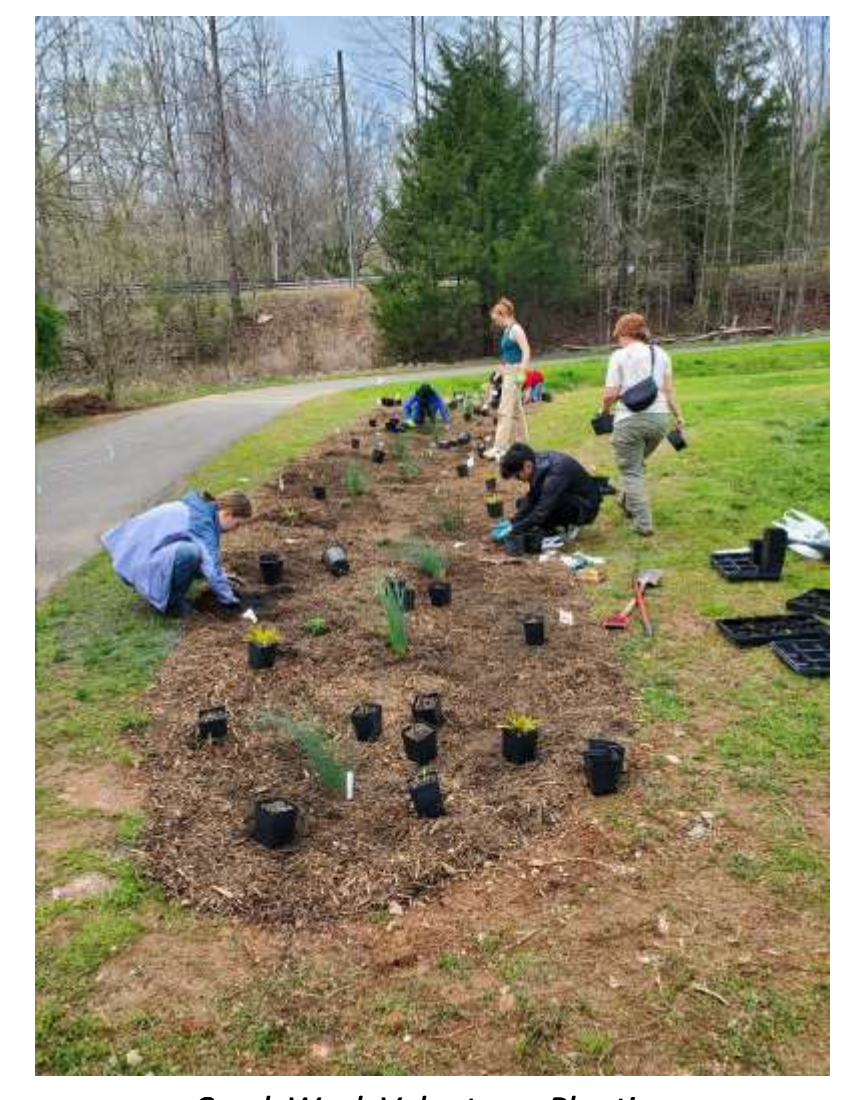
Creek Week Volunteers Planting the Riverwalk Bioswale