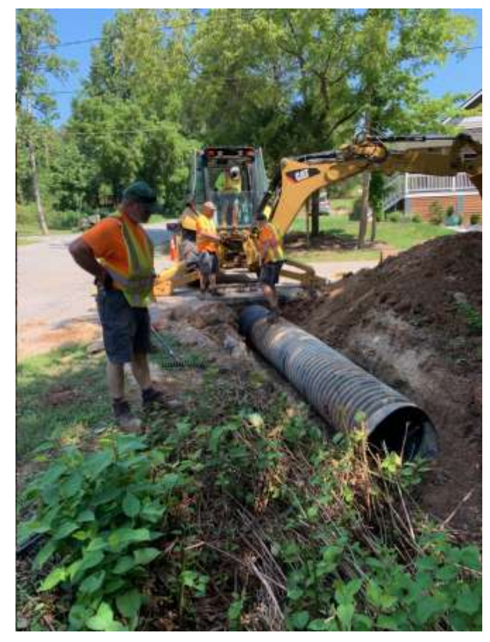
Public Works Staff Completing Stormwater infrastructure Maintenance