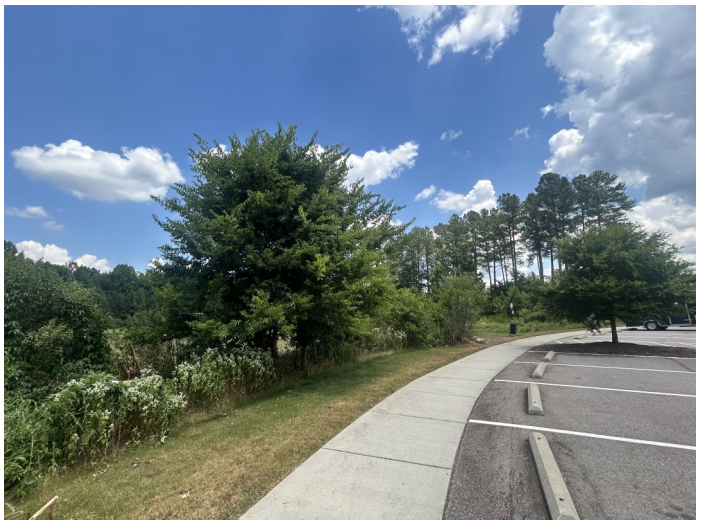
Pollinator Rain Garden