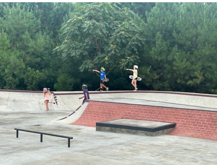
Hillsborough Skate Spot