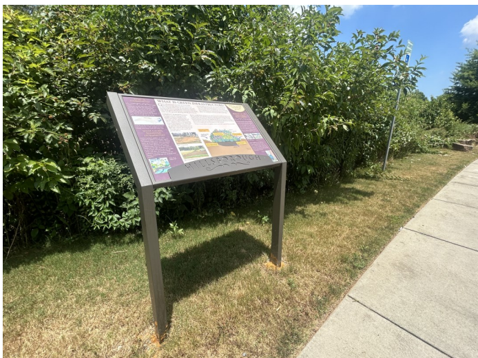
Stormwater Green Infrastructure Interpretive Sign