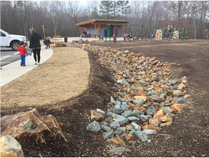
Original Stone Stormwater Swale