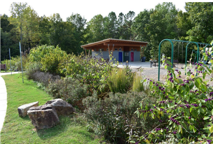
Restroom Facilities and Pollinator Rain Garden