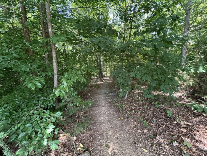
Informal Trails in Wooded Area