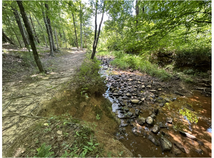
Creekside Compaction Caused by Informal Trails