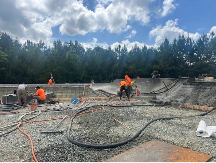
Skate Spot Construction