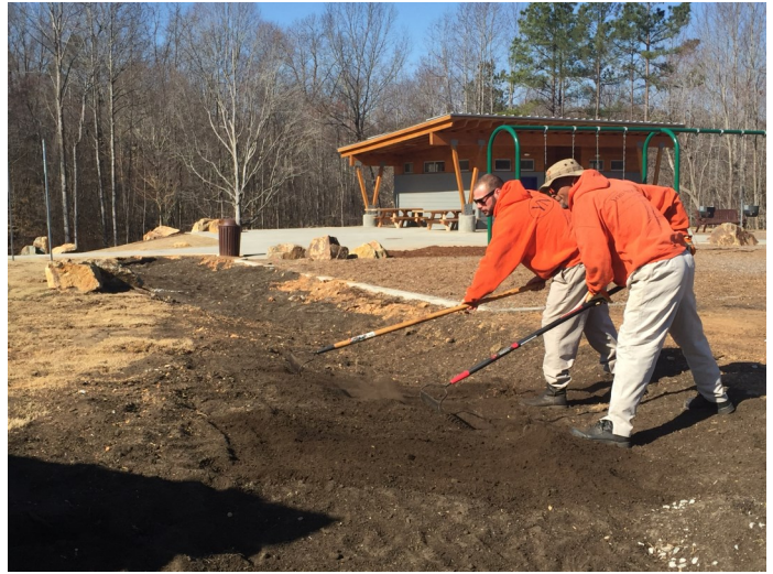
Pollinator Rain Garden Installation