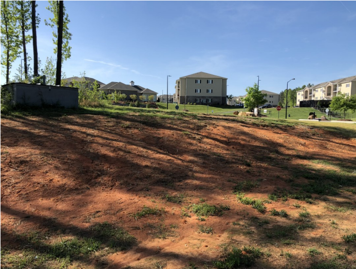
Original Eroding Slope by Multi-Purpose Field