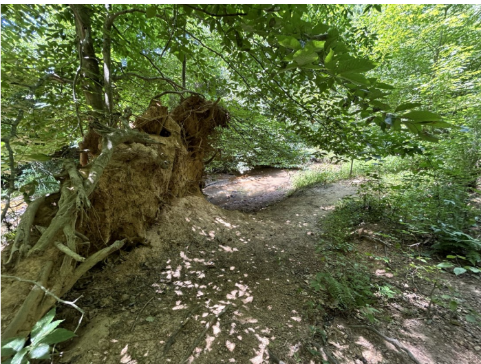
Fallen Creekside Tree