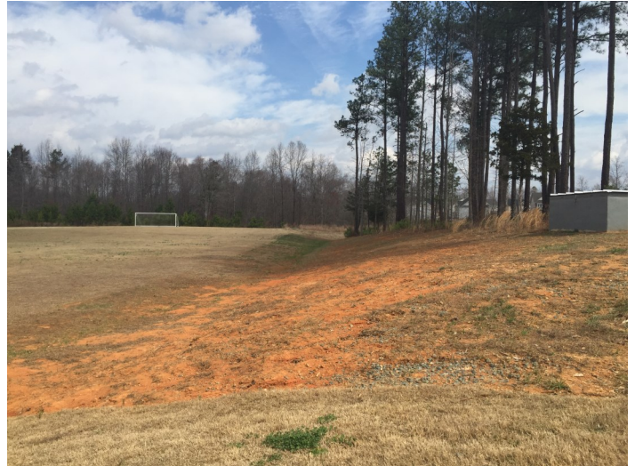
Original Eroding Slope by Multi-Purpose Field