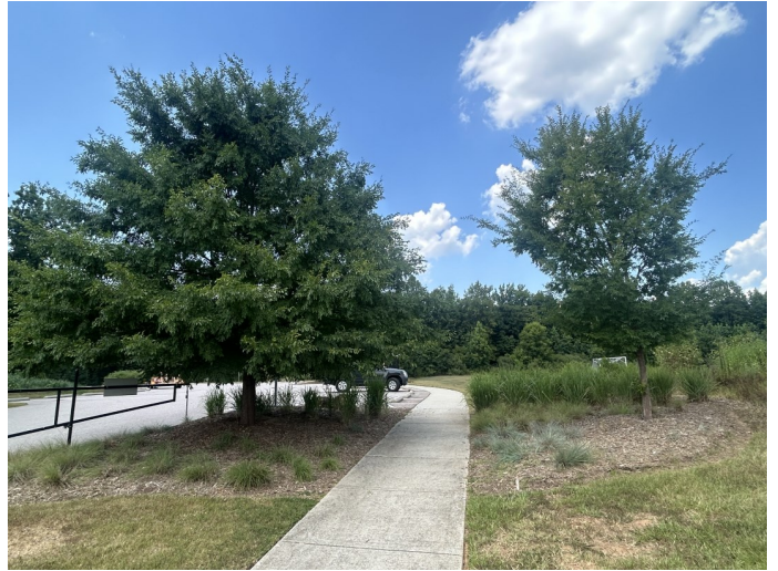
Native Plantings at Park Entrance