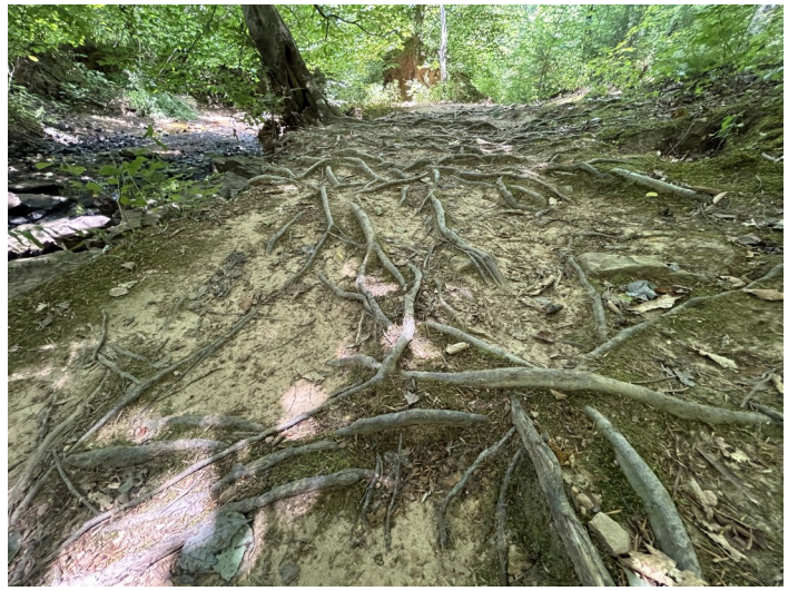
Exposed Tree Roots Caused by Compaction