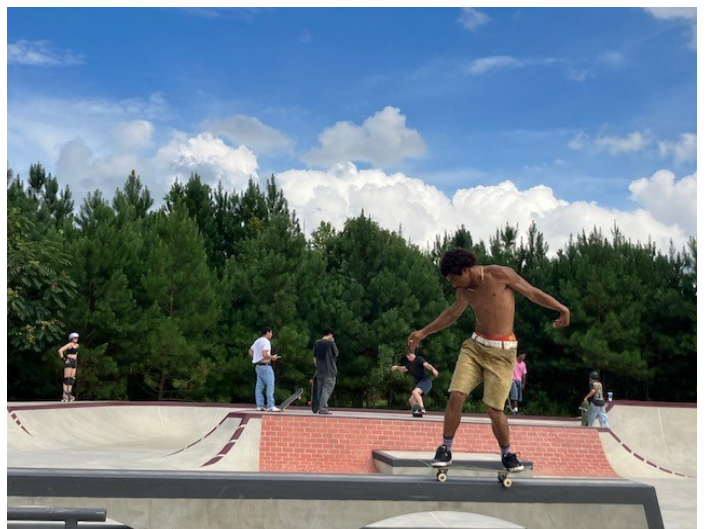
Hillsborough Skate Spot