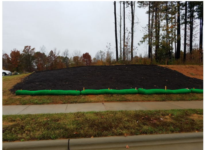
Compost Blanket Installation