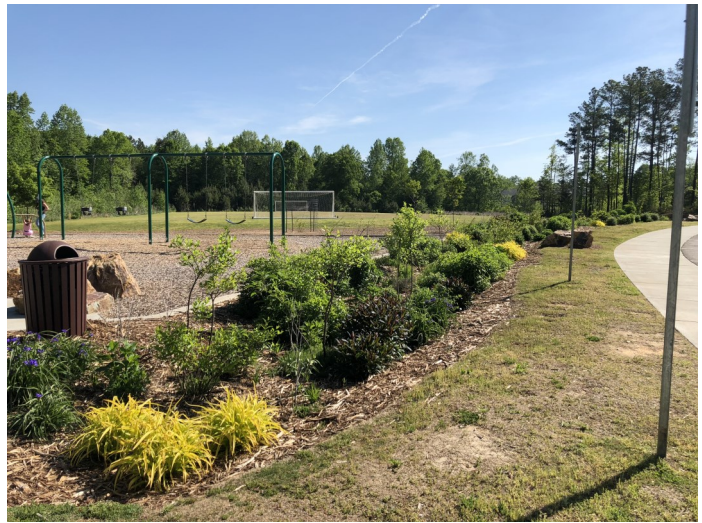
Pollinator Rain Garden Plantings