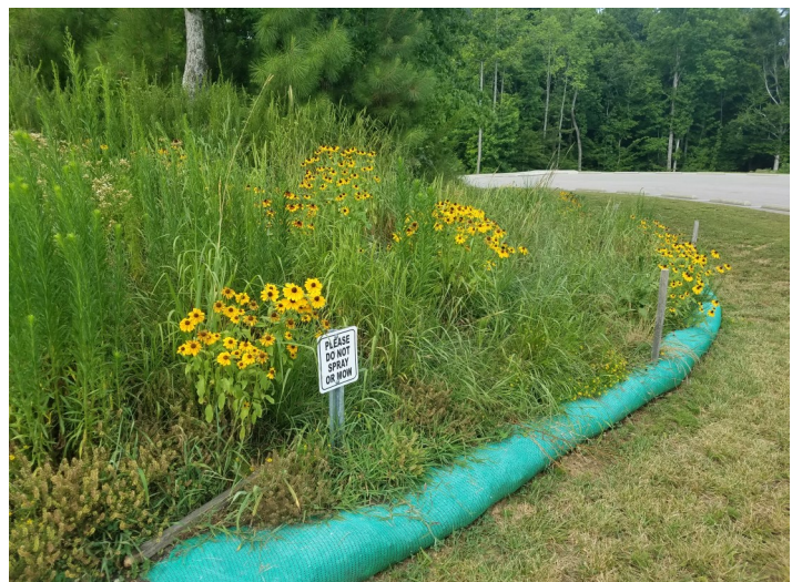
Compost Blanket Plantings