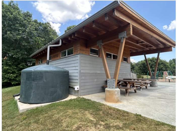
Rainwater Harvesting Cistern