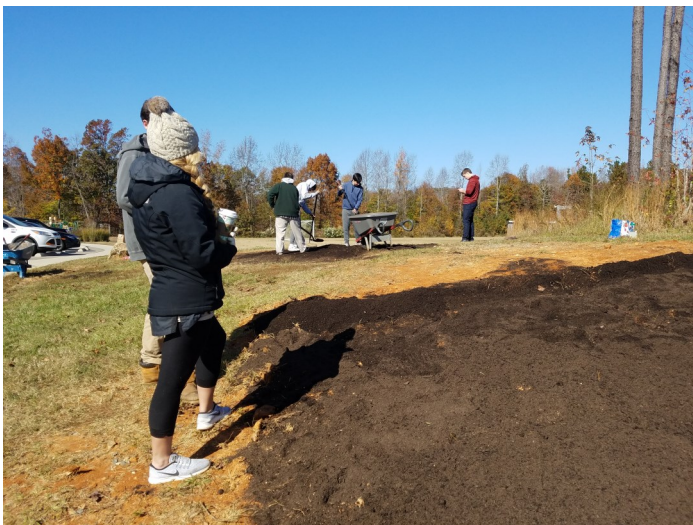
Compost Blanket Installation