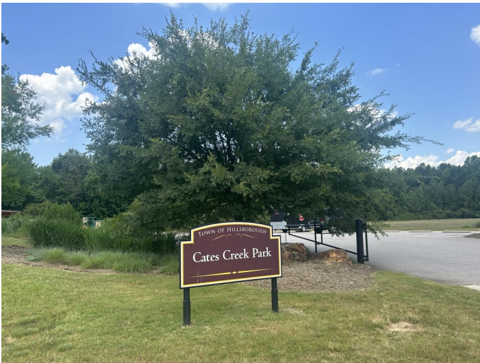
Cates Creek Park Entrance

Photos of existing conditions and park improvements are shown below and on the following pages.