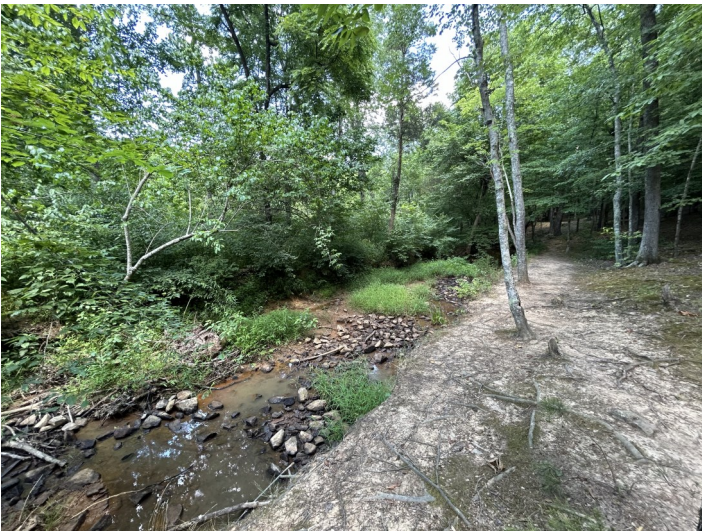
Creekside Compaction Caused by Informal Trails