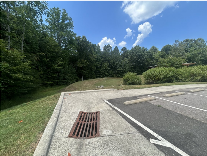
Improved Parking Area Drainage