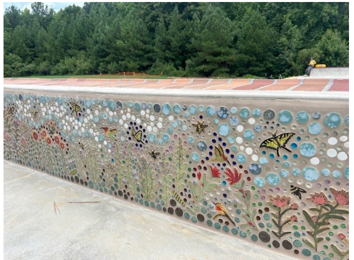
Mosaic Showcasing Native Plants and Pollinators at Skate Spot