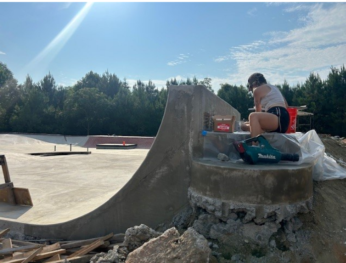
Installation of Mosaic by Artist Payton Flynn at Skate Spot