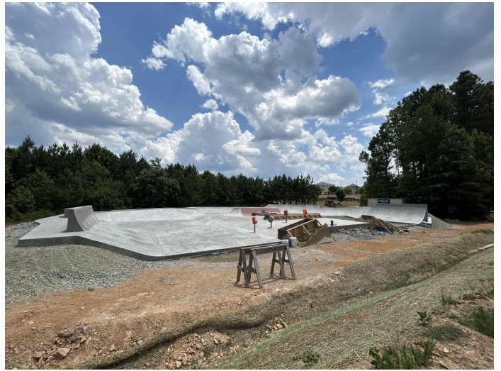
Skate Spot Construction