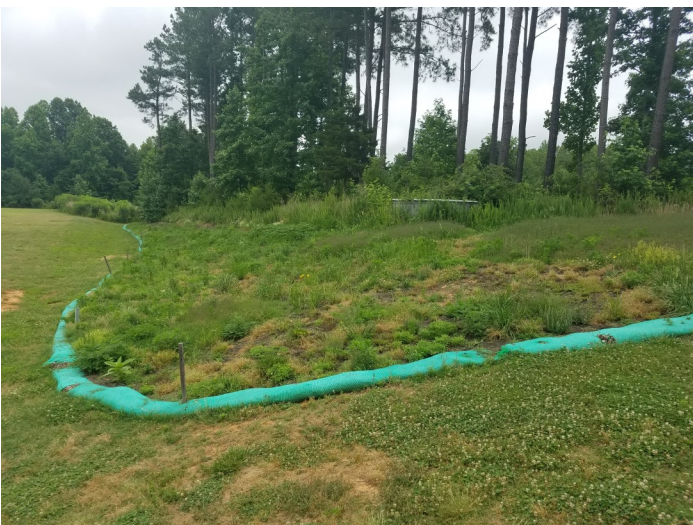
Compost Blanket Plantings