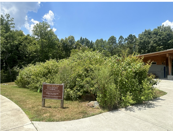
Pollinator Rain Garden