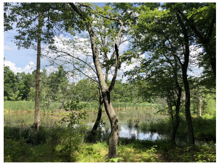
Cates Creek Wetland Area