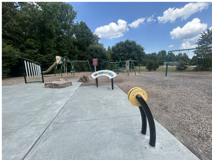
Accessible Musical Play Stations