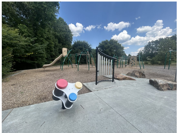
Accessible Musical Play Stations