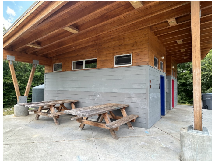
Picnic Area At Restroom Facilities