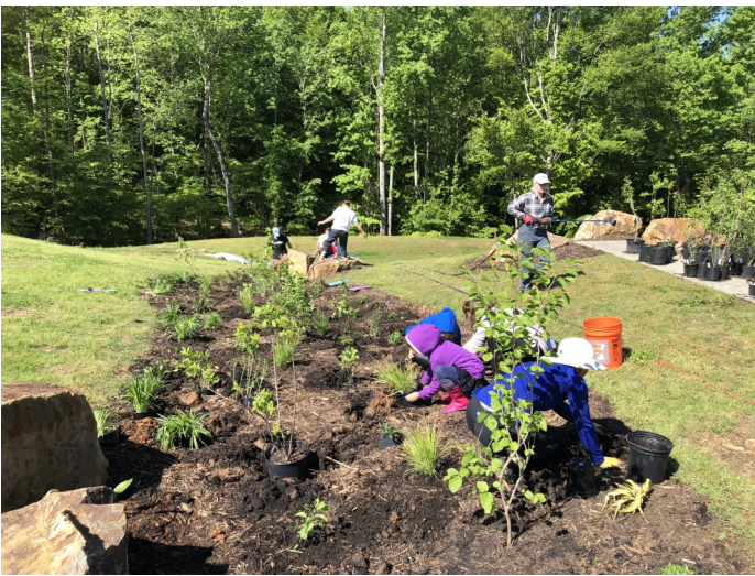
Pollinator Rain Garden Planting