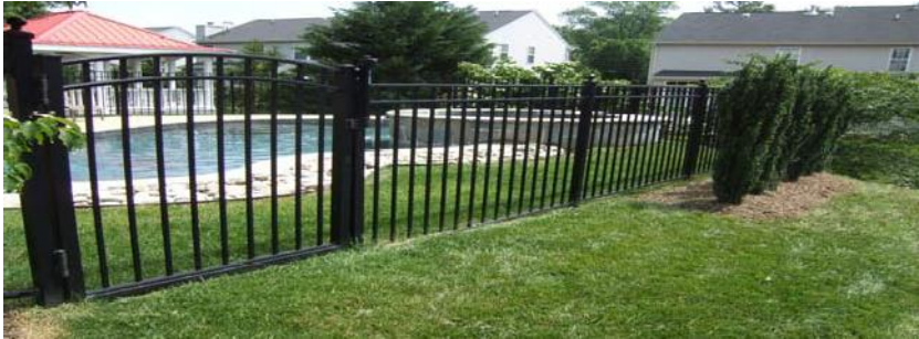
Wrought Iron Fence