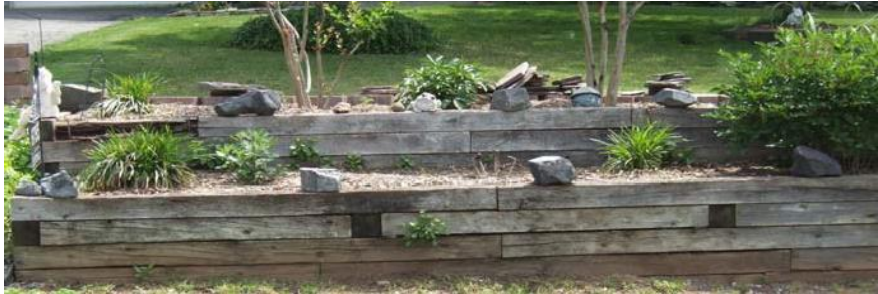
Wood Retaining Wall