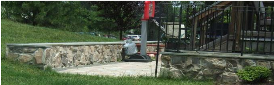
Stone Retaining Wall