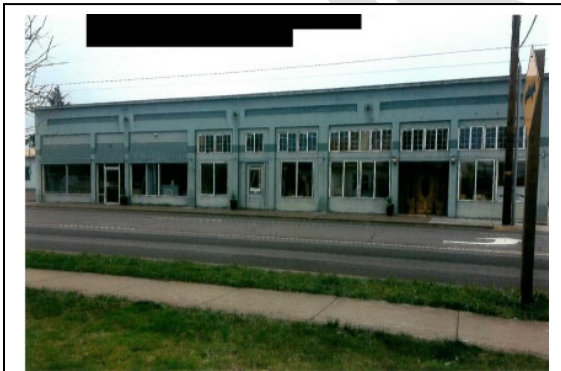
Figure 2: Before

PROJECT: 1920 MOODY HARDWARE BUILDING – JIM & BRENDA HOILAND OF JB WOODWORKS. 206 S. 3 RD ST. COMPLETED IN DECEMBER 2019. $18,992 PRIVATE EXPENDITURES – HRA $18,992: TOTAL OF $37,984 INVESTED ~ RMV INCREASE OF $86,450