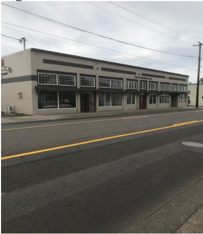
Figure 5: After

JIM & BRENDA REPLACED WINDOWS AND DOORS, PLUS INSTALLED NEW AWNINGS. THEY ALSO REPLACED DILAPIDATED PLASTER ON THE SOUTH WALL AND INSTALLED NEW SIGNS. NEW PAINT FINISHED THE LOOK, ALONG WITH THE RESTORED MOODY HARDWARE SIGN.