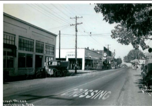
Figure 1: Before (1940's)