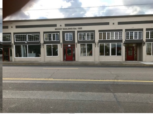
Figure 4: After