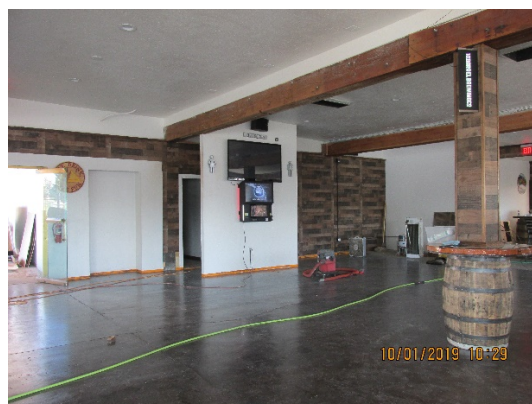
Figure 10: Interior view, (under construction) concrete work & patio entrance

The interior has stained concrete floors, wood salvaged from the project, new restrooms, a new kitchen and new bar area. A stage was also added.