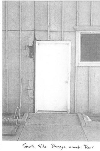
South Side Damage around Door