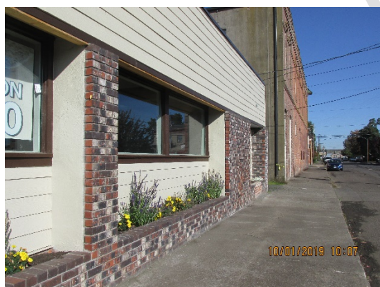
Figure 9: After-View from the corner of Moore & 2nd

THE VIEW NORTH ON 2 ND ST IS SUBSTANTIALLY BETTER; PLANTERS ARE UTILIZED AND REPRESENT HARRISBURG HIGH SCHOOL COLORS