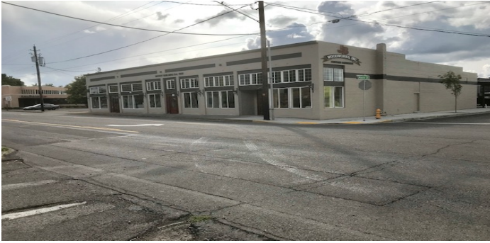
Figure 3: After