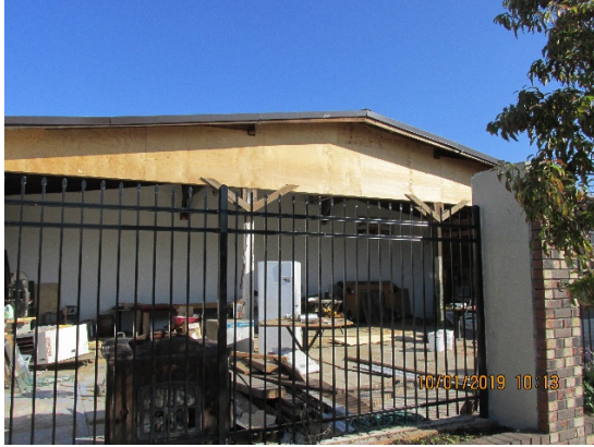
Figure 11: Rear Patio area under construction

THE PATIO AREA IS PERFECT FOR SUMMER IN HARRISBURG, WITH WROUGHT IRON FENCING THAT MATCHES THE HISTORICAL DISTRICT.