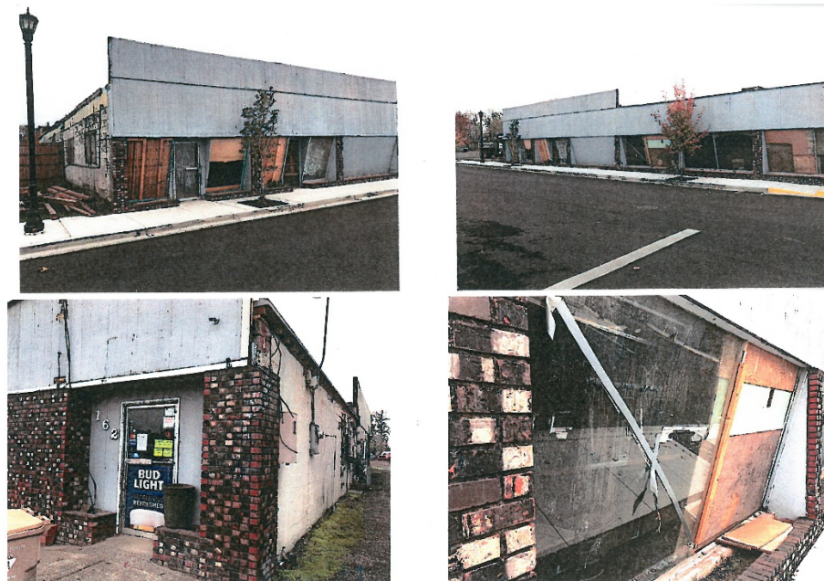
Figure 8: Before - Views from Smith St. and Moore St.