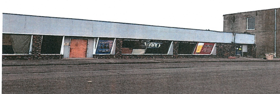
Figure 7: Ron-D-Voo - East Elevation View

THE RON-D-VOO BUILDING WAS BLIGHTED, RUN DOWN, AND SOME OF IT WAS UNUSABLE. THERE HAD BEEN A SECONDHAND STORE ON THE SOUTH SIDE OF THE BUILDING, WHICH WAS PACKED FLOOR TO CEILING WITH KNICK KNACKS, AND WAS ONLY OPEN ONCE A WEEK OR ON OCCASION. A TAVERN OCCUPIED THE OTHER HALF. THERE WAS A LARGE STORAGE AREA ON THE BACKSIDE OF THE BUILDING, WHICH WAS USED FOR STORAGE OF HOUSEHOLD GOODS FOR THE OWNERS. THE ROOF WAS DECLARED AS DANGEROUS, AND HARRISBURG FIRE VOLUNTEERS WERE TOLD TO AVOID USING THE ROOF IF THE PROPERTY WERE TO CATCH ON FIRE. THE RESTAURANT/BAR HAS SINCE BEEN RENAMED AS 'THE VOO', AND NOW TAKES UP THE ENTIRE FRONT PART OF THE BUILDING ADJACENT TO 2 ND ST. THE STORAGE PART OF THE BUILDING WAS SPLIT IN HALF. ONE HALF NOW COMPRISES THE OUTDOOR RESTAURANT/BAR AREA, WHILE THE OTHER HALF WAS DEVELOPED INTO A THRIVING CROSS-FIT GYM, WHICH PROVIDES THE OWNERS WITH MORE REVENUE. THE OWNERS PUT SUBSTANTIALLY MORE INVESTMENT INTO THE BUILDING THEN LISTED ABOVE, BUT ONLY A PORTION OF IT WAS REPORTED TO THE HRA IN SUPPORT OF THEIR GRANT.