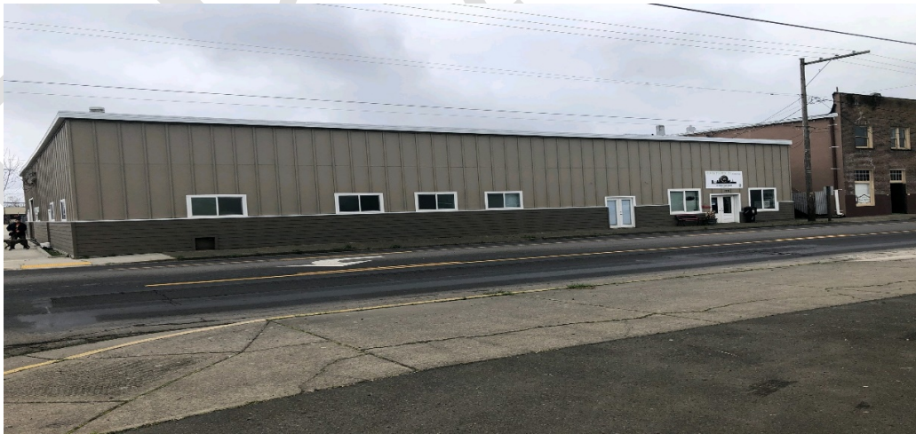
Figure 6: After - East Elevation View

SCOTT & RENEE HAD EXTENSIVE DRY-ROT, REPLACED DILAPIDATED T-1-11 SIDING WITH FIBER CEMENT LAP SIDING, AND ADDED FIBER CEMENT BOARD AND BATTEN. THEY ALSO REPLACED THE TRIM ON WINDOWS & DOORS AND FINISHED WITH NEW PAINT. THE BUILDING NOW HOUSES 3 DIFFERENT BUSINESSES.