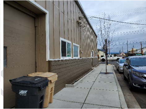
Figure 2 – Before Siding around windows Figure 3 – Before, Siding around door