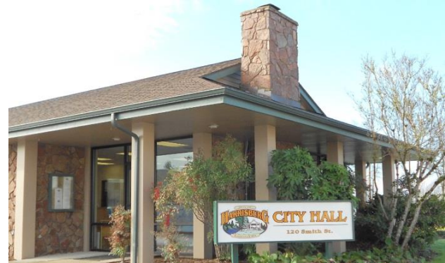
Harrisburg City Hall

Actions: Continue to publish annual budget and audit results on the City's website. Achieve annual audit with no reportable findings of non-compliance. Investigate software options that could provide greater transparency and access to city information and data.