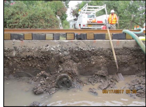
4th Street Railroad Project

Actions: Work with consultant provided through and by ODOT/TGM Grant to complete a new Transportation System Plan (TSP). Complete a prioritized project list of needed transportation improvements that address the UGB expansion and other changing conditions, while updating the Transportation SDC's