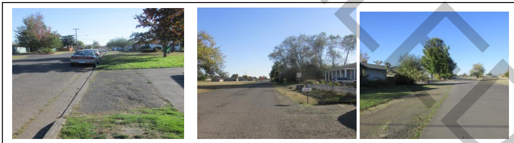
9th St. @ Burton, and nearby– 9 th & Territorial St. SRTS Project

Actions: Apply for SRTS Grant in 2022/2023.