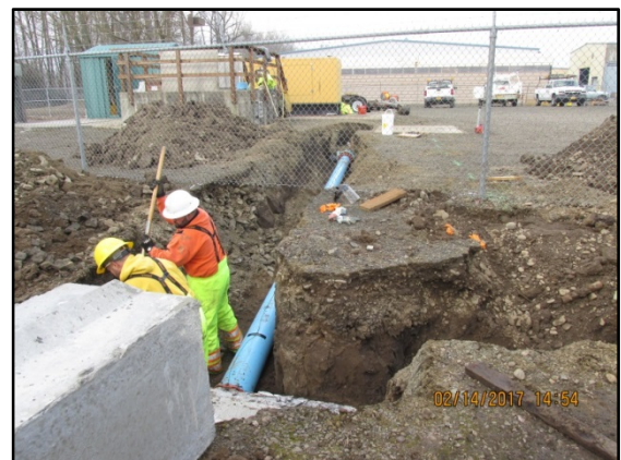
City crews repairing sanitary sewer system

Actions: Design and construct LaSalle Street pump station and piping beneath the railroad crossings on LaSalle Street.