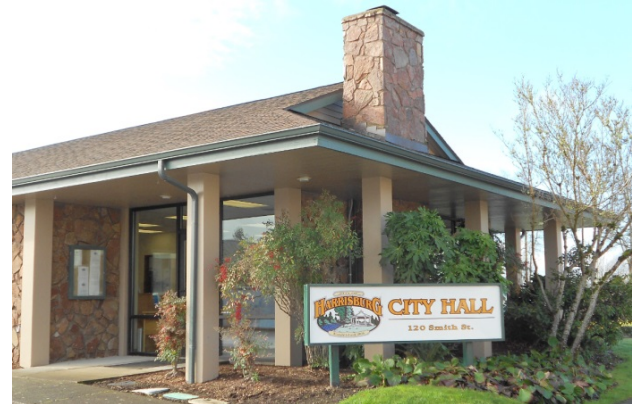
Harrisburg City Hall

Actions: Continue to publish annual budget and audit results on the City's website. Achieve annual audit with no reportable findings of non-compliance.