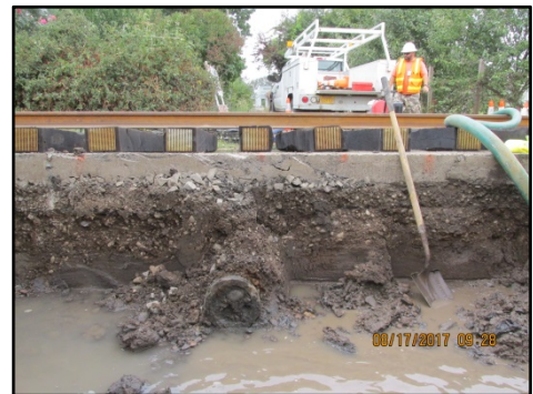
4th Street Railroad Project

Actions: Apply for a grant through the Oregon Department of Transportation (ODOT) Transportation and Growth Management (TGM) program to update the City's TSP. The plan update needs to address the UGB expansion and other changing conditions.