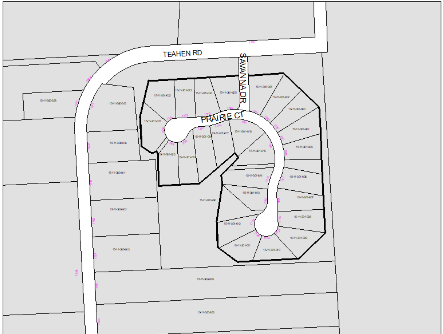
Exhibit A, Page 2