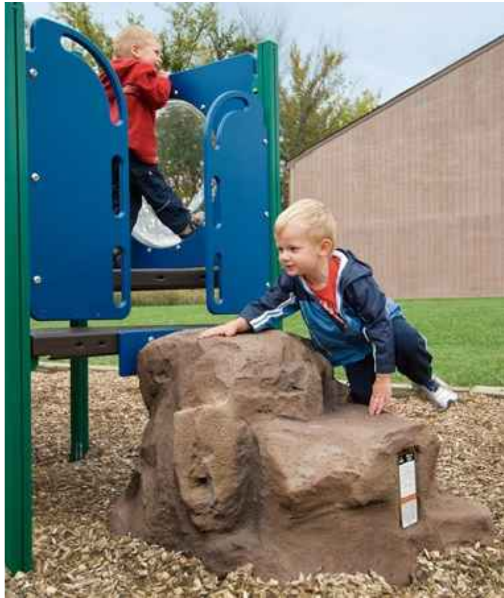
STEPPER - NATURAL STONE