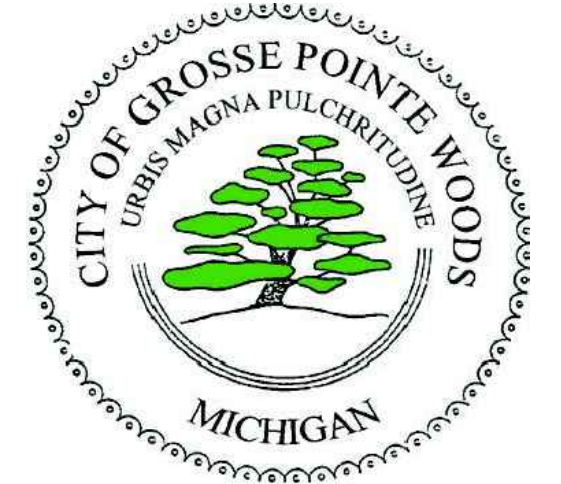
MASTER PLAN DESIGN