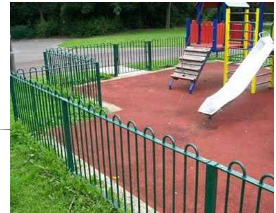
PLAYSCAPE FENCE SURROUND