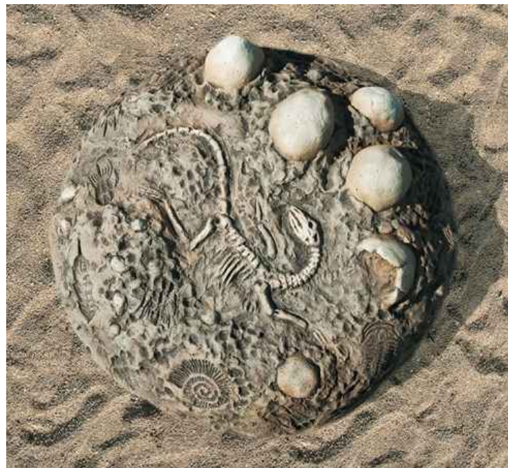
DINO FOSSIL DIG - STONES