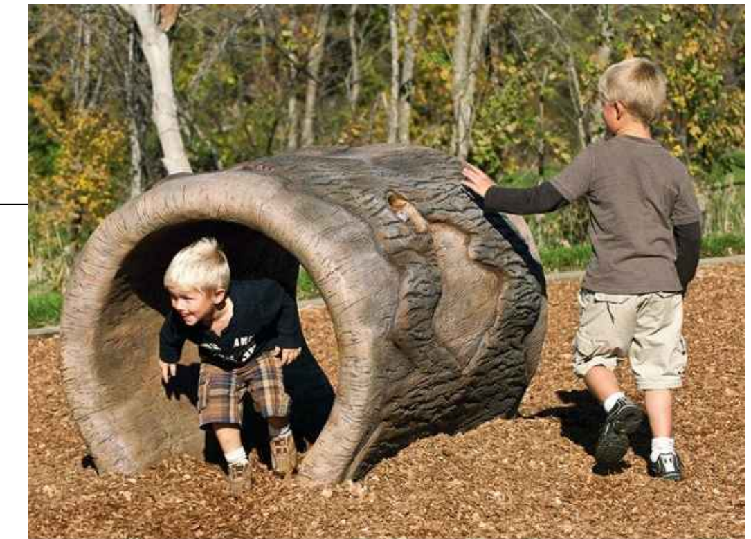
LOG CRAWL TUNNEL