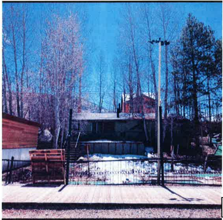
SITE --> BEFORE

Truepenny had a successful first season at 1016 Grand Avenue, and was well received by visitors and locals alike. Most of the feedback was regarding the reinvigoration and use of the space itself. Folks were happy to see that the property had been given some love, and many with dietary restrictions and preferences were pleased to have a nourishing snack/light meal option in town. Having been at this location for a season now, we will be able to improve upon and refine what is already established on site in order to make it even more accommodating and enjoyable to guests of the business. Since summer, Truepenny's homemade granola has gained popularity and can now be found on menus and retail shelves across the county. So thank you for granting this permission last year. This location gave our little business a boost, and we had a great deal of fun too.