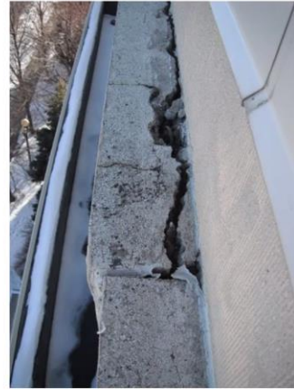
heavy separation and entry points for air and water