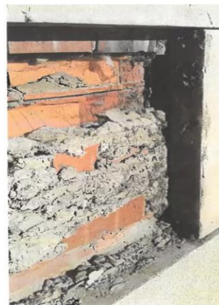
deterioration of the exterior and lack of mechanical attachment