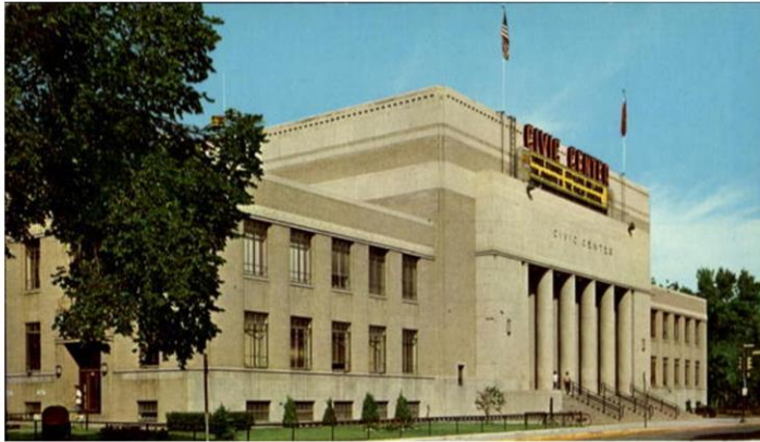
Great Falls Civic Center Exterior Envelope . A Review