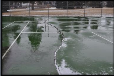
Existing Tennis Courts