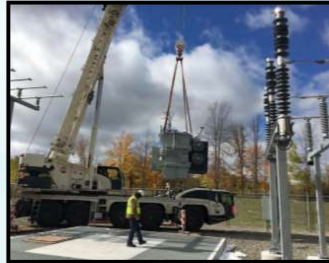
Transformer Rating 18.6 MVA