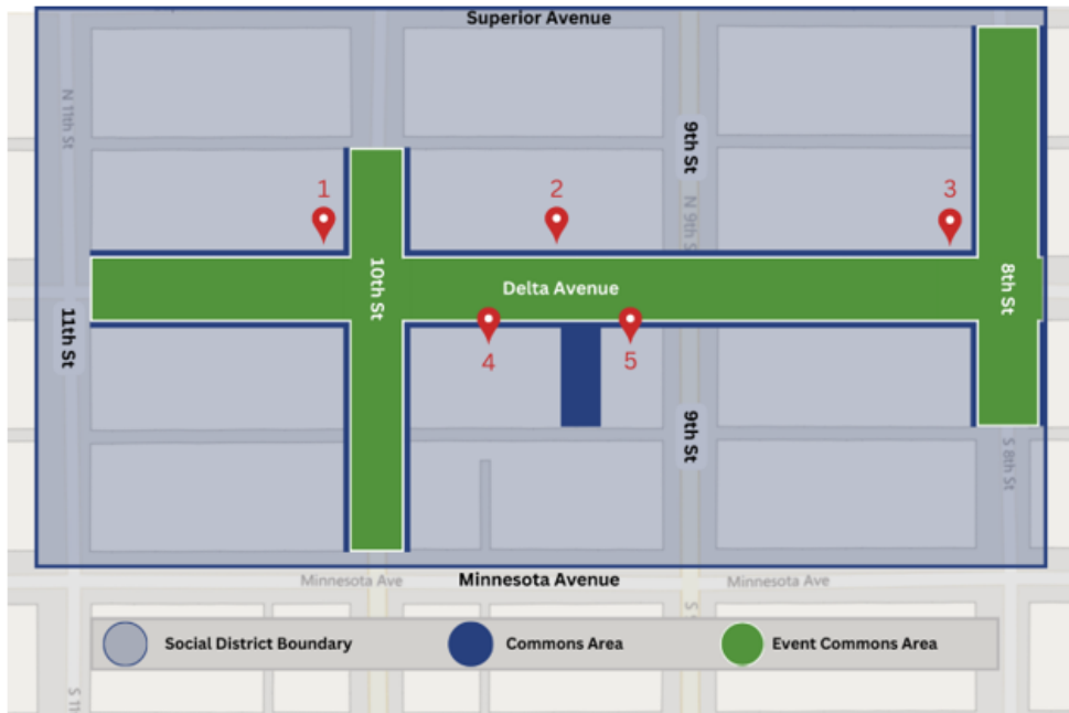
City of Gladstone Proposed Social District Map & Qualified Licensees

The City of Gladstone’s proposed social district boundary would allow for five existing licensed establishments to participate in the district. It is recognized that this list of eligible establishments may change or grow over time.