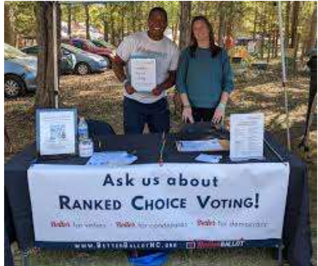
Better Ballot North Carolina