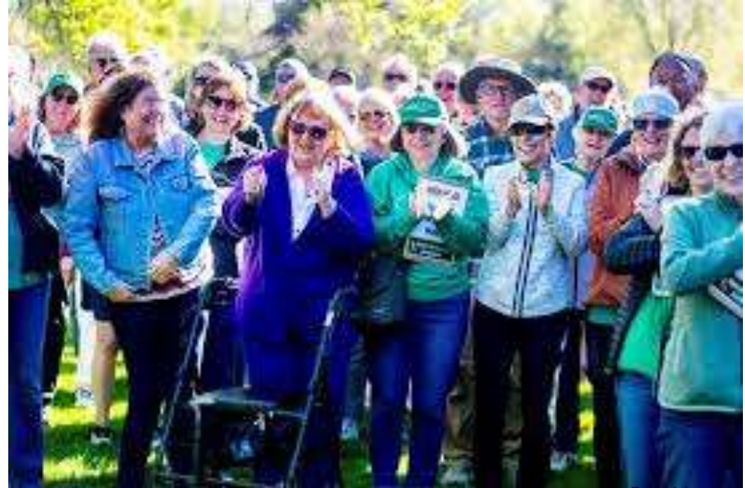
East Idaho News