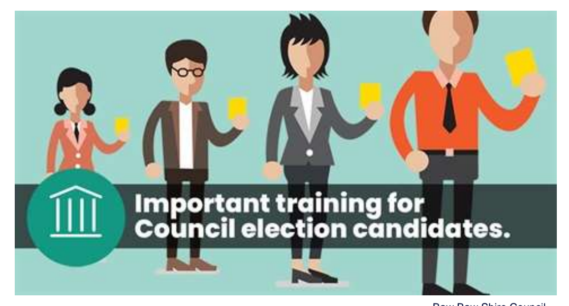
Baw Baw Shire Council

Does anyone from Council want to participate?