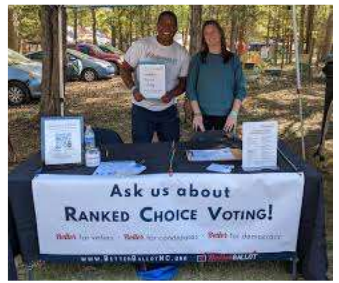
Better Ballot North Carolina