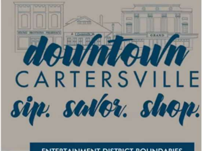
ENTERTAINMENT DISTRICT BOUNDARIES