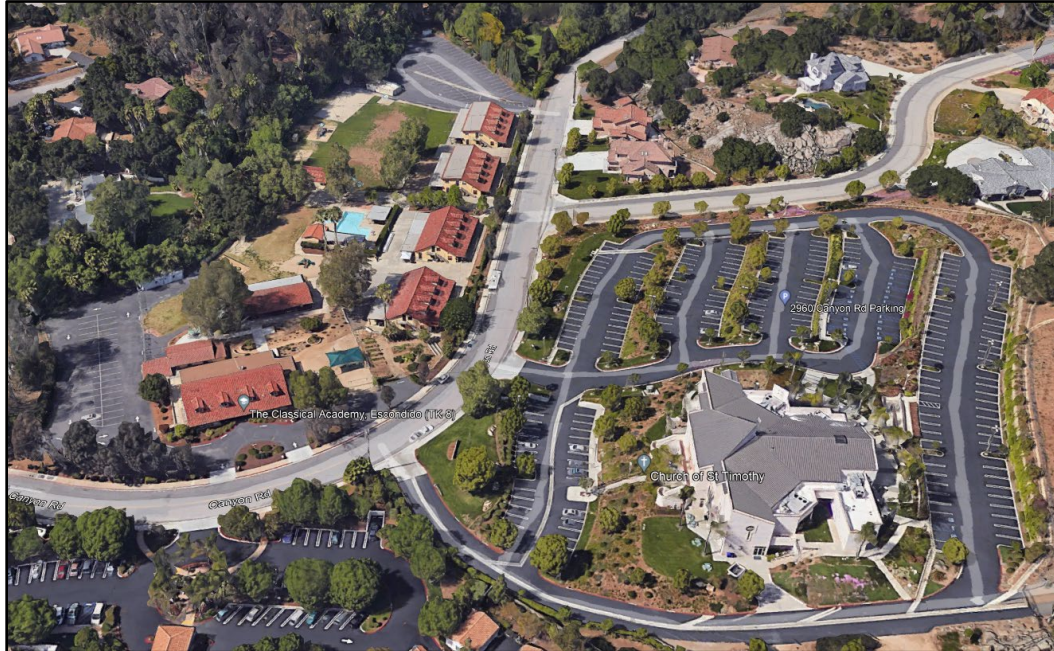
Figure 5: Nearby church offers parking for parents.