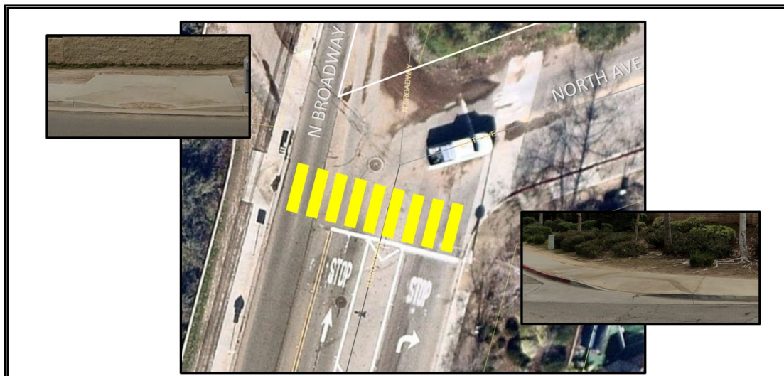
Figure 2 Proposed crosswalk at N Broadway and North Ave.

The requested crosswalk is shown in Figure 2 . The location has existing curb ramps and the existing STOP limit line is positioned so that no additional striping modifications would be necessary to install a marked crosswalk.