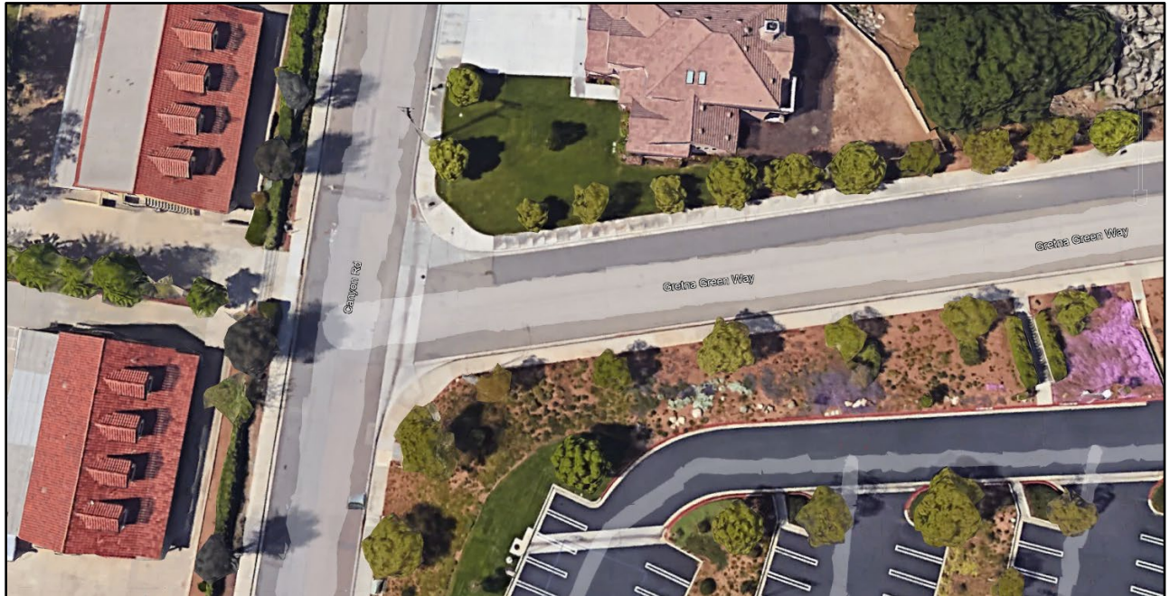
Figure 4: Crosswalk improvements are requested for Canyon Road at Gretna Green Way

The school maintains a parking agreement with the Church of St. Timothy located on the east side of Canyon Road. Parents are able to park in the church parking lot and walk their children along Canyon Road to cross at Gretna Green Way. The school assigns staff and students to guide pedestrians through the unmarked crossing and instruct vehicular traffic through the intersection.