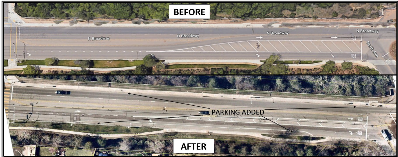
Figure 1 Striping changes to N Broadway between Reidy Creek Elementary School and North Ave.

Following completion of the striping changes, in August 2022, Girl Scout Troop 2080, contacted the Traffic Engineering Division requesting a marked crosswalk at the intersection of N Broadway and North Avenue to be included in the next Traffic Management Priority List (See Attachment 1 ).