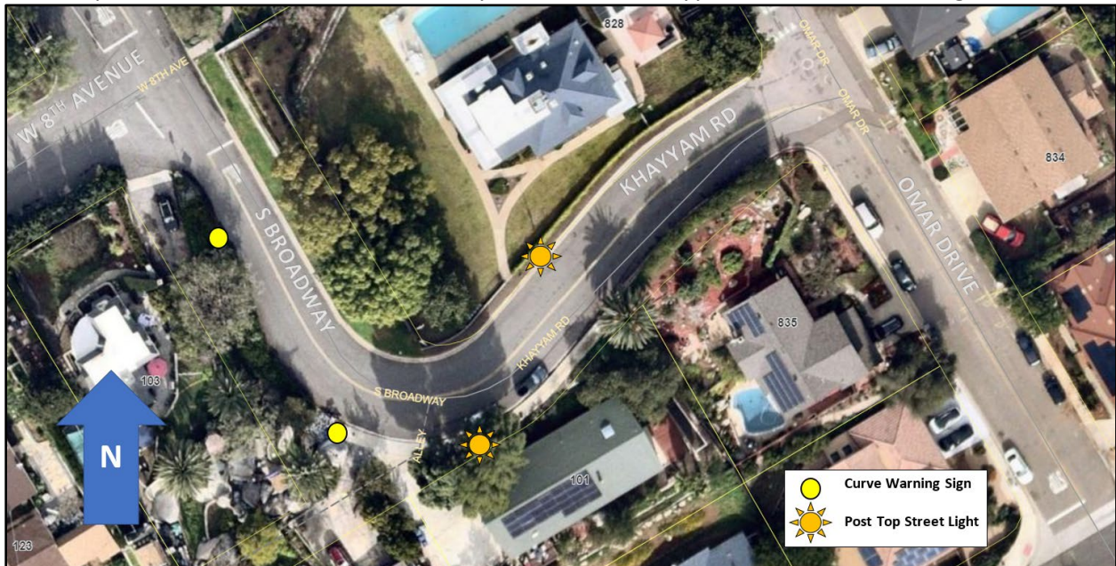
Figure 9 Aerial view of S Broadway/Khayyam Road

The sharp horizontal curve where S Broadway transitions to Khayyam Rd can be seen in Figure 9 .