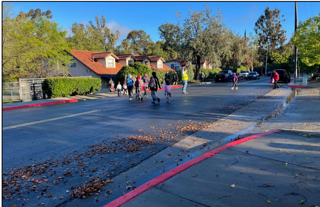
Figure 7: Red curb was added to improve pedestrian visibility in the crossing at Canyon Road and Gretna Green Way

On-street parking demand is high in both the AM and PM peak-hours. During the first site visit staff noted that parked vehicles obstructed view of crossing pedestrians. Red curb was added on Canyon Road at Gretna Green Way in January 2022 to improve pedestrian visibility. This has significantly improved conditions at the crossing.