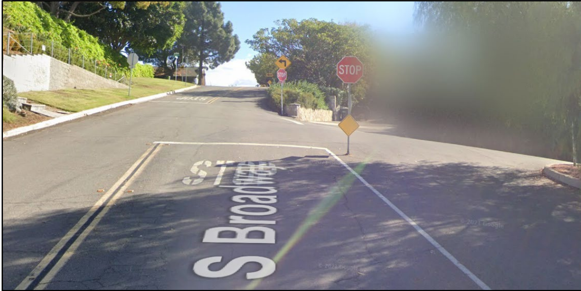
Figure 8 S Broadway approach to W 8 th Avenue.

The sharp horizontal curve where S Broadway transitions to Khayyam Rd can be seen in Figure 9 .