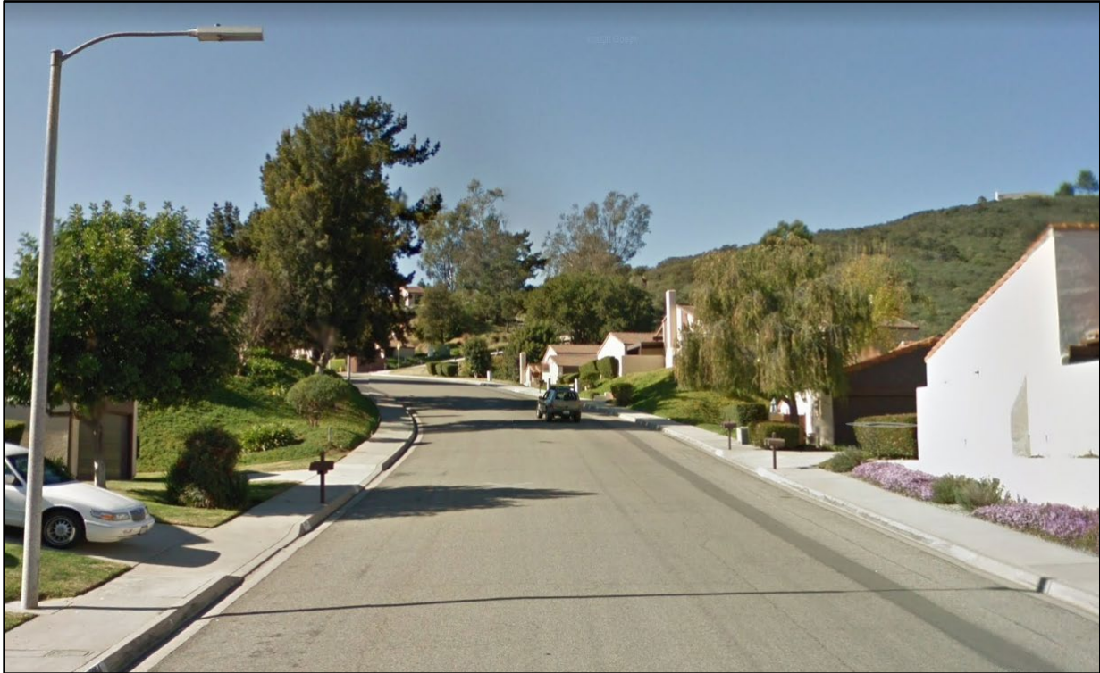
Figure 11 Facing westbound on Golden Circle Drive west of Barbara Dr.