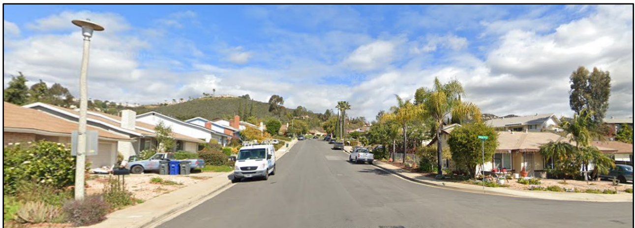
Figure 10 Facing northbound on Golden Circle Dr at Felice Dr.

The Police Department has deployed the radar speed trailer along this roadway over the years with the speeding issues persisting. The following Figures 10 and 11 shows the grade of Golden Circle Dr at Felice Dr and just west of Barbara Dr.