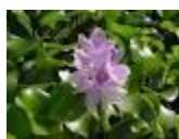
Eichhornia crassipes - Common water hyacinth