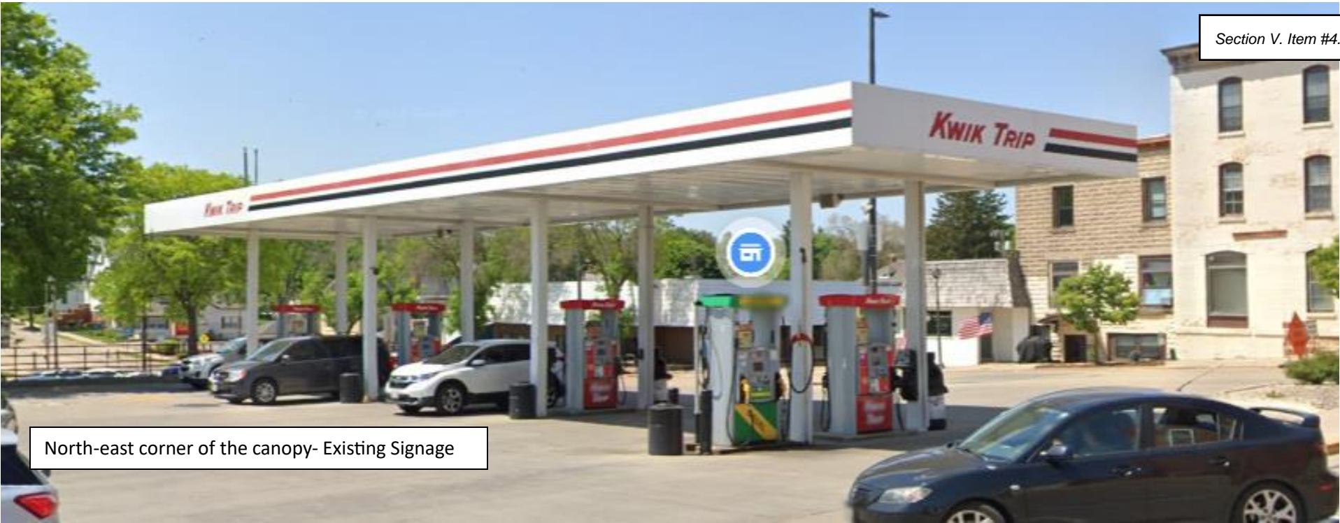
North-east corner of the canopy- Existing Signage