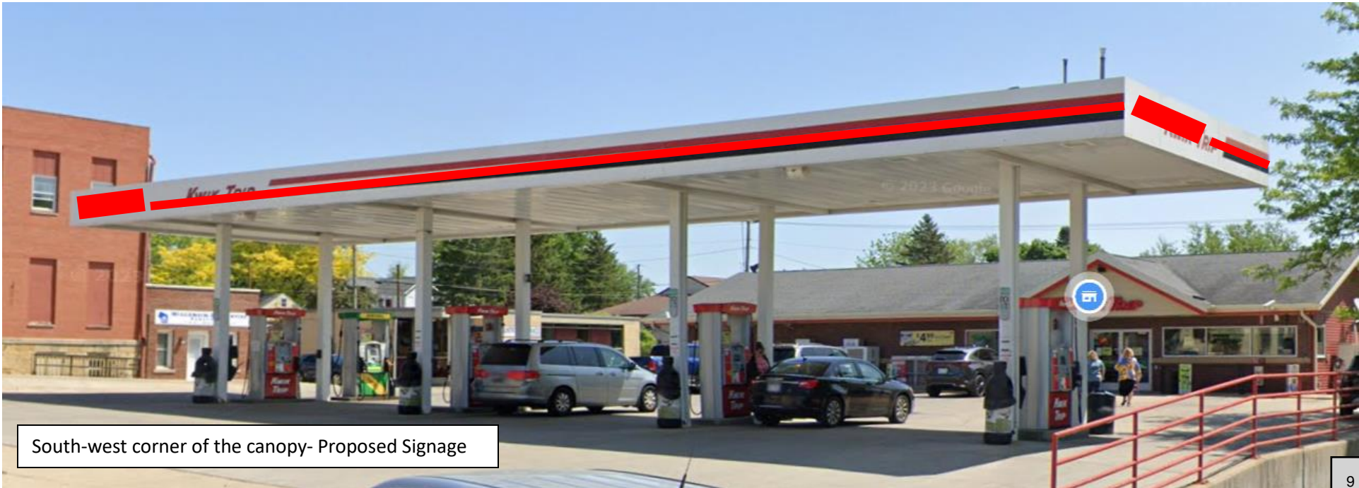
South-west corner of the canopy- Proposed Signage