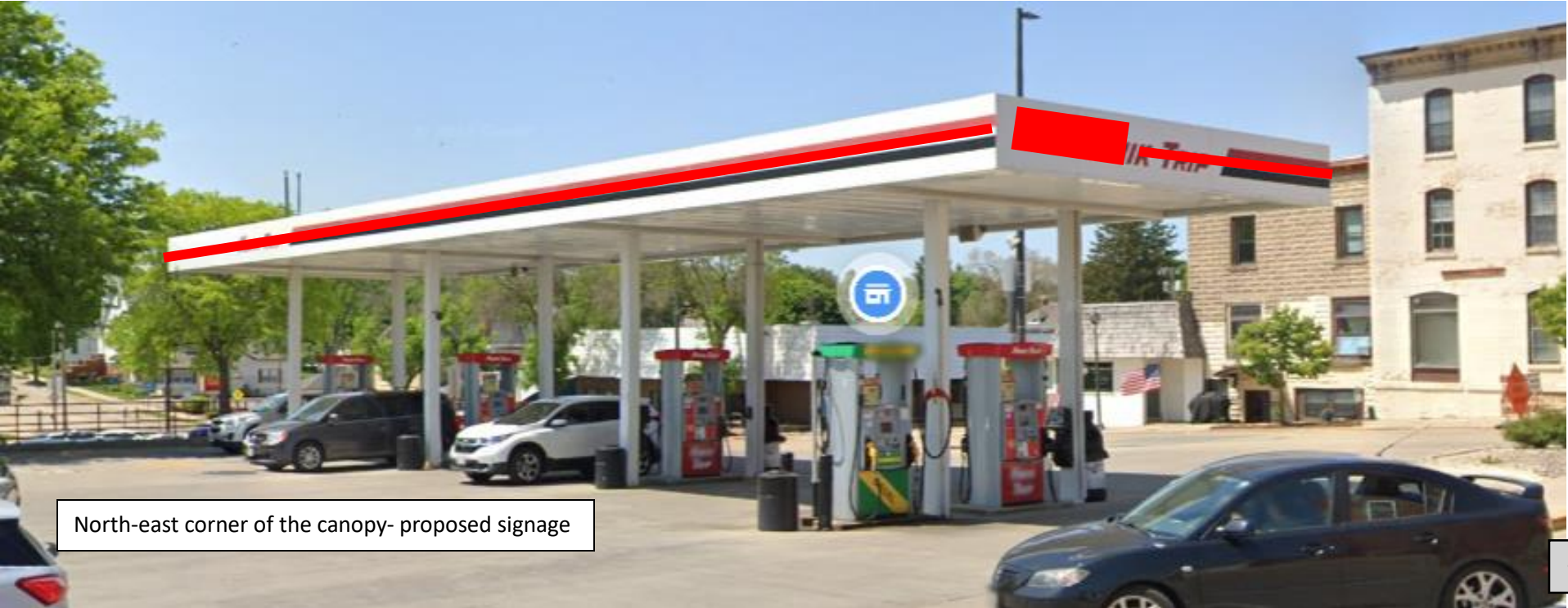
North-east corner of the canopy- proposed signage