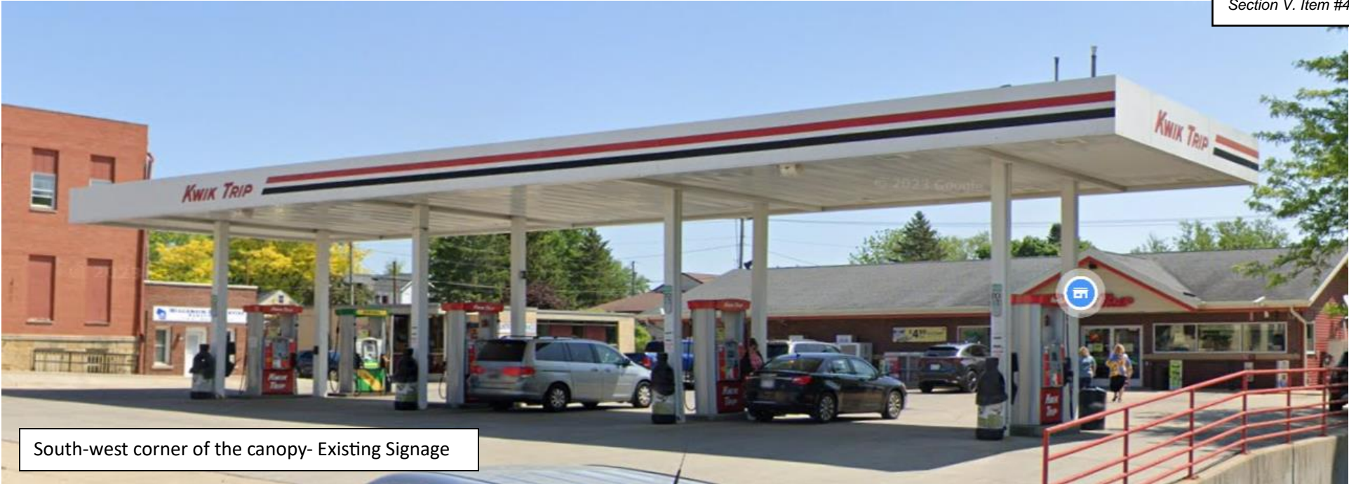
South-west corner of the canopy- Existing Signage