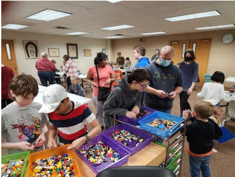
Above: Patrons enjoy the March 15 session of LEGO at the Library, featuring a "Spaceship" theme. We had 49 people attend our hour-long session.