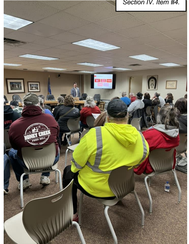
Right: Our Estate Planning 101 session with Russell Law Offices helped 39 patrons better understand their how estate planning works.