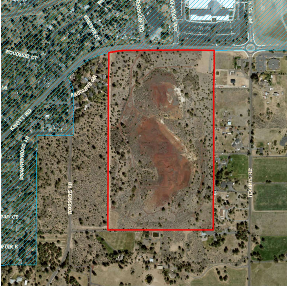
Figure 1: Location Map and Proximity to Bend UGB

PROPOSAL: The Applicant requests approval of a Comprehensive Plan Map Amendment to change the designation of the subject property from Surface Mine to Rural Residential Exception Area. The Applicant also requests approval of a corresponding Zoning Map Amendment to change the zoning of the subject properties from Surface Mining (SM) to Multiple Use Agricultural (MUA10).