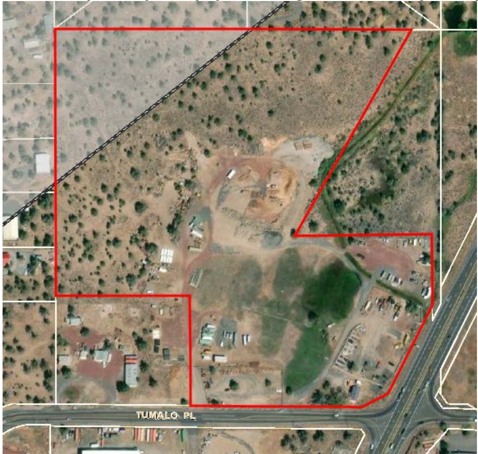
Figure 3: Extent of the Airport Safety Combining Zone on the Subject Property

No new structures, uses, or other type of development is proposed. The does not propose to alter any nonconforming use. Any future alteration of a verified, nonconforming use will be reviewed against the standards of DCC 18.80. Staff finds the provisions of DCC 18.80 do not apply to the subject application because no new development is proposed.