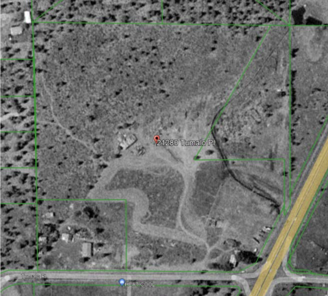
Figure 4: Google Earth Aerial Image Dated May, 1994

However, staff notes one portion of the subject property where it appears development has changed over time. As shown in the figure below, an aerial image dated September 2006 indicates the area in the south portion of the subject property, to the west of the 'Pink Building,' was undeveloped with sparse vegetation.