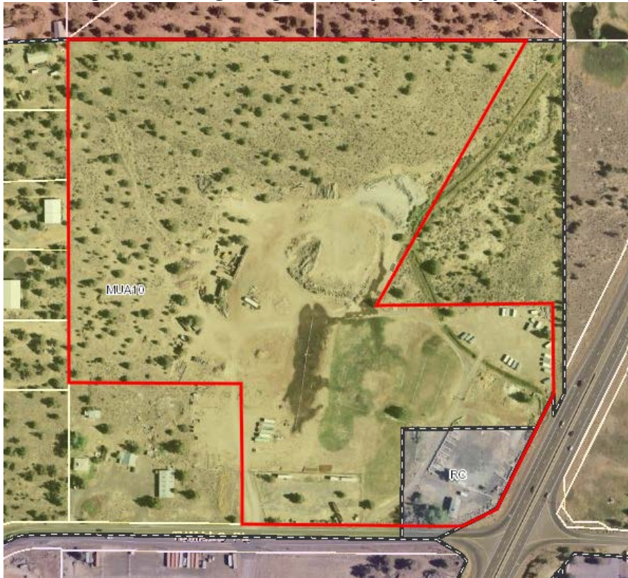
Figure 1: Zoning Designations of Subject Property

REVIEW PERIOD: The subject application(s) were submitted on June 21, 2022. The application was deemed incomplete on July 13, 2022, and a letter detailing the information necessary to complete review was mailed. The application was subsequently deemed complete by the Planning Division on December 18, 2022. The applicant submitted one request to extend the clock for a total of 30 days. The 150th day on which the County must take final action on this application is June 16, 2023.