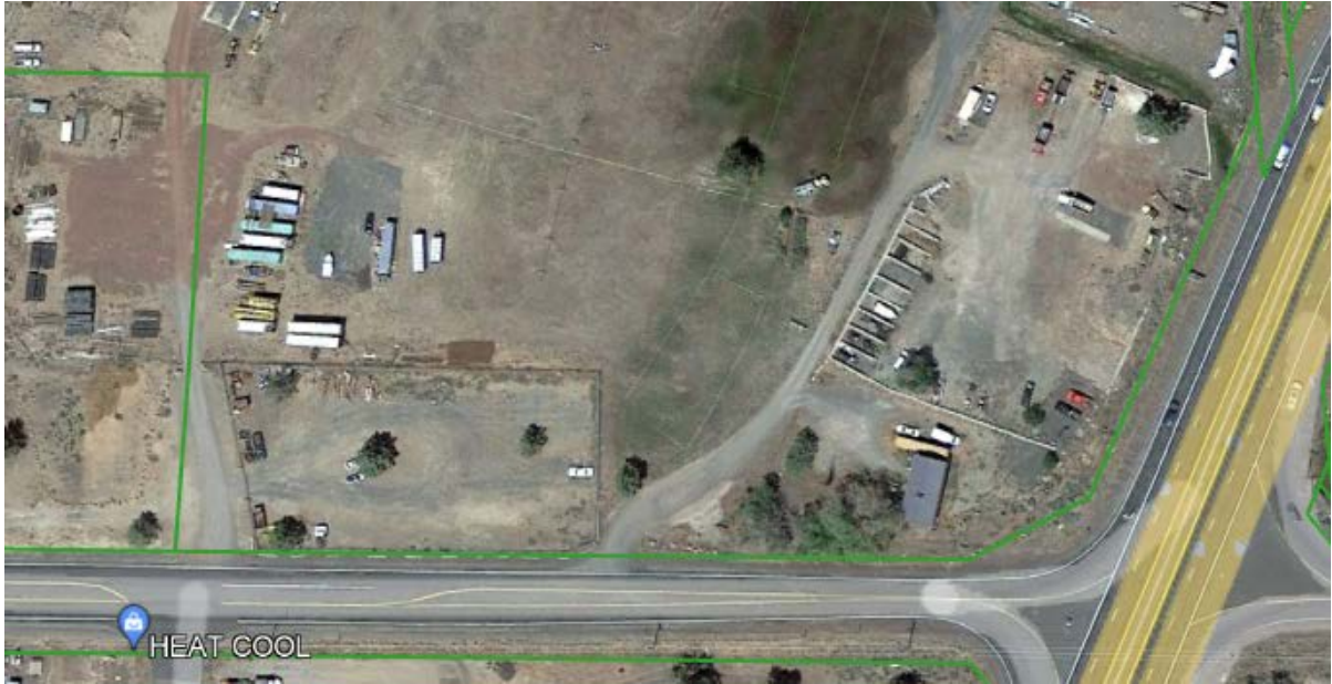
Figure 6: Southern Portion of Subject Property, Google Earth Aerial Image dated July 2022

Staff believes additional information is required to determine the nature and extent of each of the commercial and/or industrial uses on the subject property, and asks the Hearings Officer to make findings for this criterion. Staff notes that the uses on the subject property are interrelated, such as