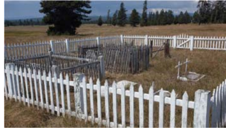
Allen Ranch Cemetery