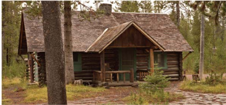
Elk Lake Guard Station

27. Elk Lake Guard Station: A wagon road built in 1920 between Elk Lake and Bend sparked a wave of tourism around the scenic waterfront. To protect natural resources of the Deschutes National Forest and provide visitor information to