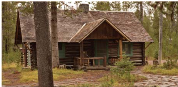
Elk Lake Guard Station

27. Elk Lake Guard Station: A wagon road built in 1920 between Elk Lake and Bend sparked a wave of tourism around the scenic waterfront. To protect natural resources of the Deschutes National Forest and provide visitor information to guests, the Elk Lake Guard Station was constructed in 1929 to house a forest guard.