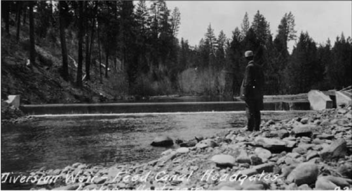
Tumalo Creek – Diversion Dam

19. Tumalo Creek – Diversion Dam The original headgate and diversion dam for the feed canal was constructed in 1914. The feed canal’s purpose was to convey water from Tumalo Creek to the reservoir. The original headworks were replaced and the original 94.2 ft low overflow weir dam was partially removed in 2009/2010 to accommodate a new fish screen and fish ladder. The remaining original structure is a 90 foot (crest length) section of dam of reinforced concrete. Tax Map 17-11-23, Tax Lot 800 & 1600.