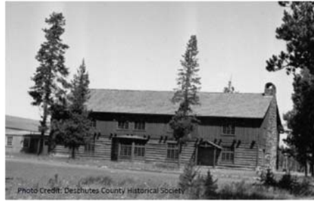
Camp Abbot Site, Officers' Club

9. Camp Abbot Site, Officers' Club: Officers' Club for former military camp, currently identified as Great Hall in Sunriver and used as a meeting hall. 20-11-5B TL 112.