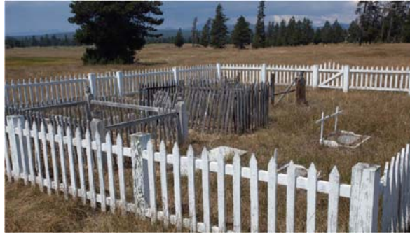
Allen Ranch Cemetery