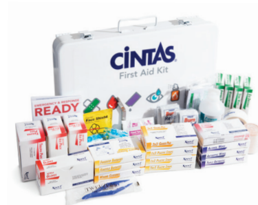
36-Unit Deluxe Vehicle Kit • 20929