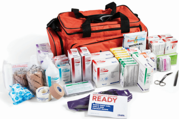
Large Mobile First Aid Bag • 22129

When you're prepared for anything, you can handle anything. If your business is on the move, Cintas First Aid & Safety has mobile kits made to meet your needs.