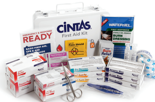
20-Unit Standard Vehicle Kit Metal • 20429 / Plastic • 20529