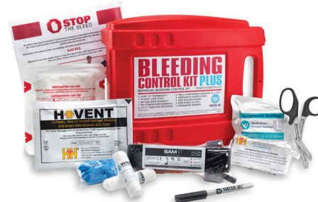
Bleeding Control Kit Standard Single Unit Kit – 20629 Standard Three Unit Kit – 613771 Standard Refill Packet – 613769 Premium Single Unit Kit – 615508 Premium Refill Packet – 615509