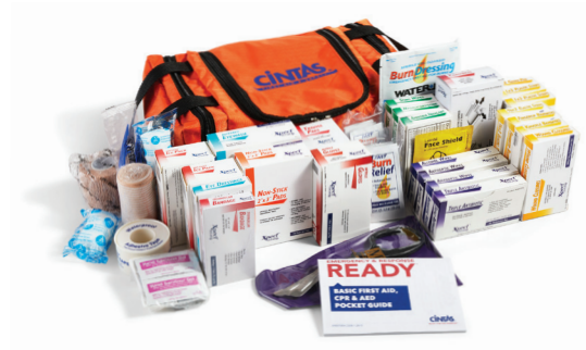
Small Mobile First Aid Bag • 21629