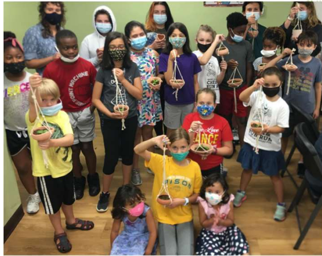
Traveling Art Camp, Summer 2021