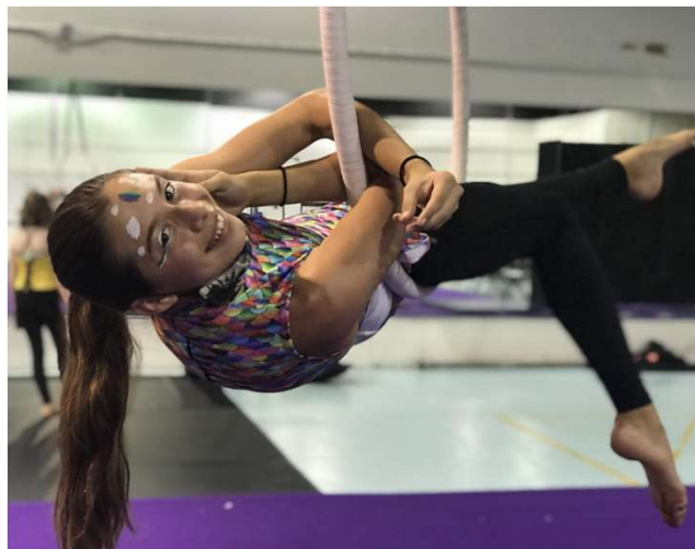
Gainesville Circus Center, Summer 2021