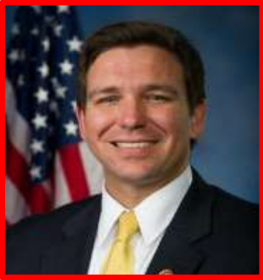
Ron DeSantis (R)