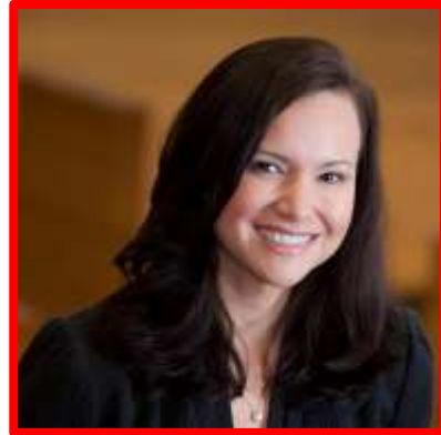
Ashley Moody (R)