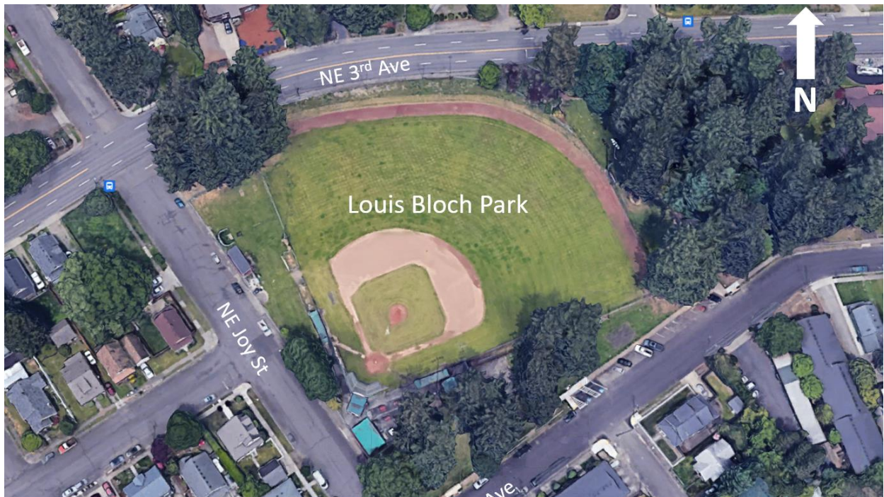
Louis Bloch Park

On January 5, 2023 bids were opened for the Louis Bloch Park Bleachers and ADA Improvements Project. A total of seven bids were received with the low bidder being Stateline LLC in the amount of $233,996.53 (after current sales tax adjustment).