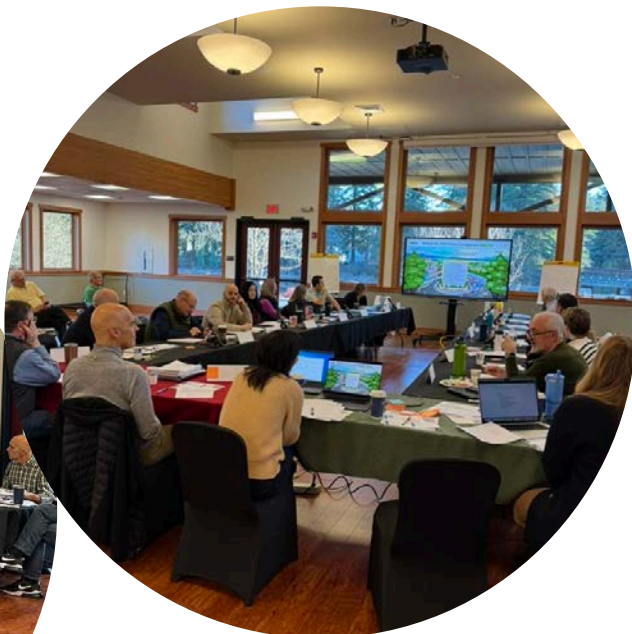
Planning Council January 2025