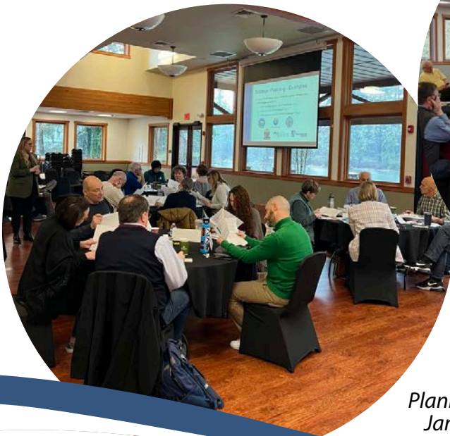
Planning Council January 2024