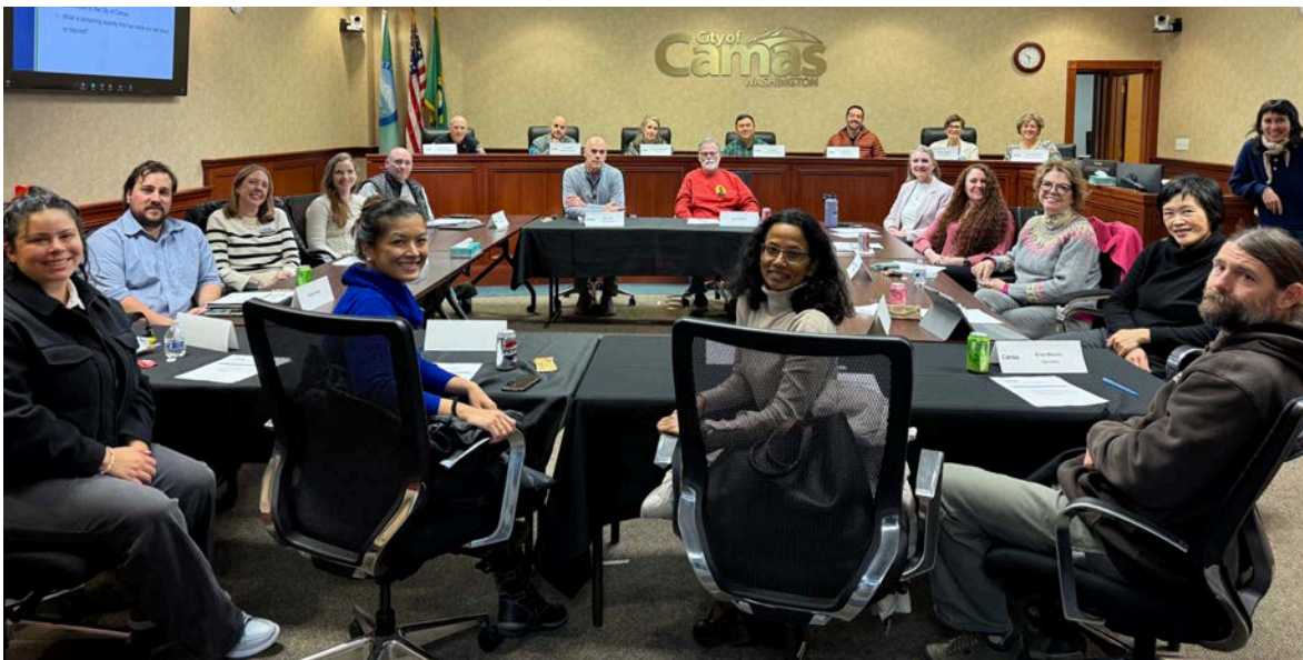
Community Advisory Committee and City of Camas Department Heads Meeting February 2025

Following the community engagement phase, PointNorth reviewed the engagement themes and findings with the Community Advisory Committee in January 2025. The CAC provided recommendations on proposed values, vision statement, and priorities. At the January 2025 planning retreat, City Council and City Department Heads achieved consensus on City values, vision statement and priority areas and priority area definitions. Between January and April 2025, City Department Heads, City Leadership and the Community Advisory Committee supported the refinement of goals, potential actions and key performance indicators for the final strategic plan. A final meeting with Community Advisory Committee members took place in March 2025, providing the community the opportunity to give input on the final plan before adoption.