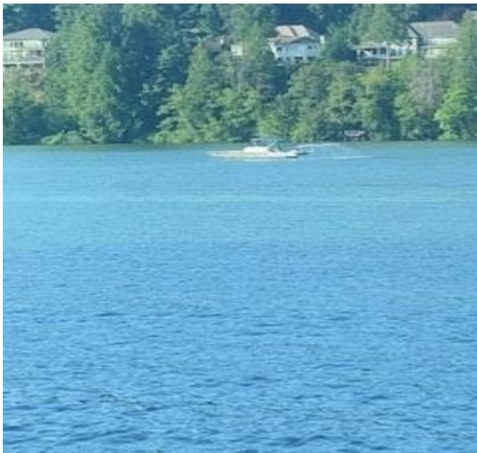
Figure 1: Chemical Treatment to Lacamas Lake, 7/15-16, 2025

SUMMARY: Aquatechnex applied the first treatment last week (7/15 and 7/16). If effective, a second treatment is anticipated in mid-August to continue to break down the phosphorous that has built up since the first application.