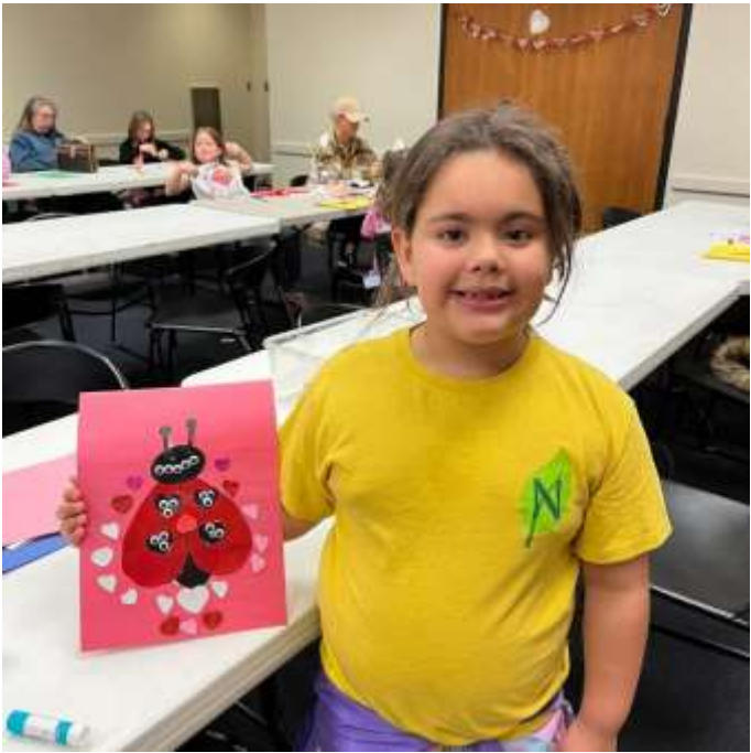
Valentine's Day Crafts Participants: 106