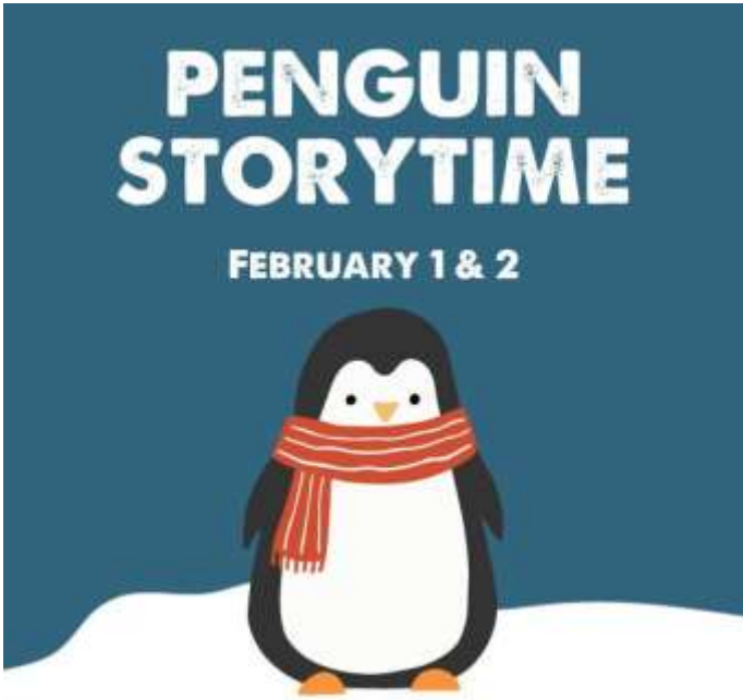
Storytime (Average Attendance) Baby: 41 Toddler: 67 Preschool: 51