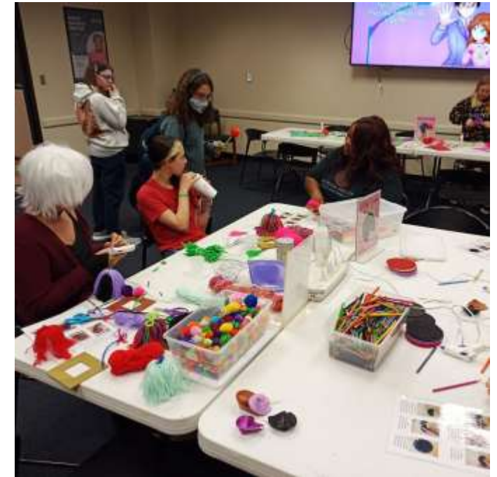
Teen Valentine's Crafts Attendance: 14