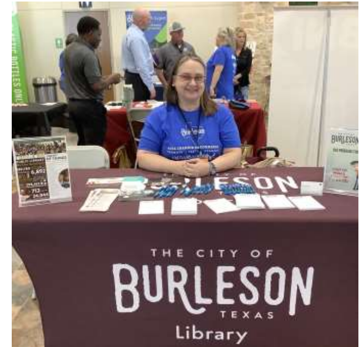
Burleson Business Showcase (with Burleson Chamber of Commerce)