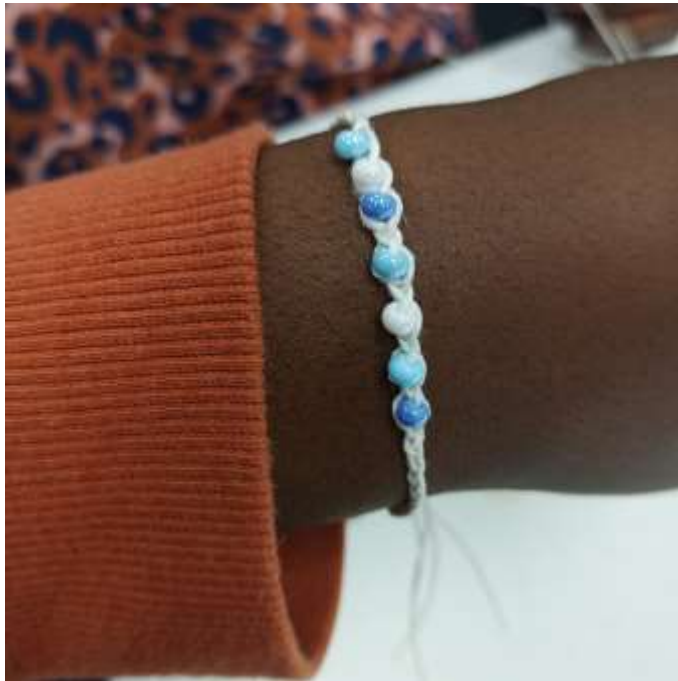
Teen Wish Bracelet Attendance: 23