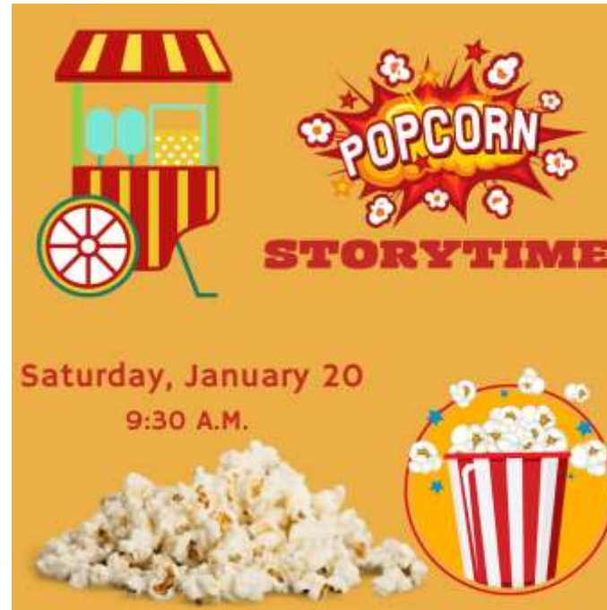
Popcorn Storytime Attendance: 36