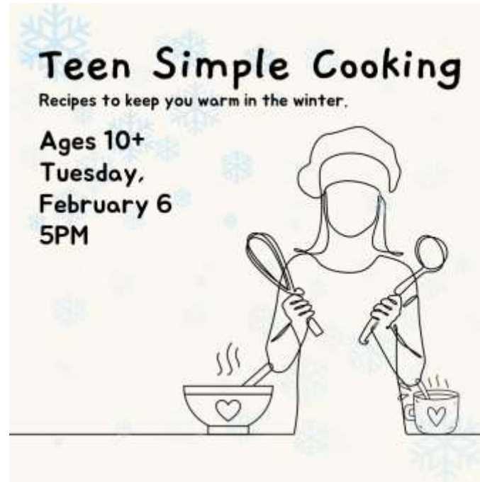
Teen Simple Cooking Attendance: 31