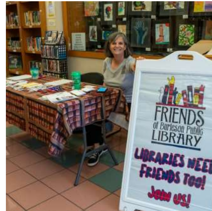
The Great Giveback (connecting citizens with nonprofit organizations) Attendance: 378