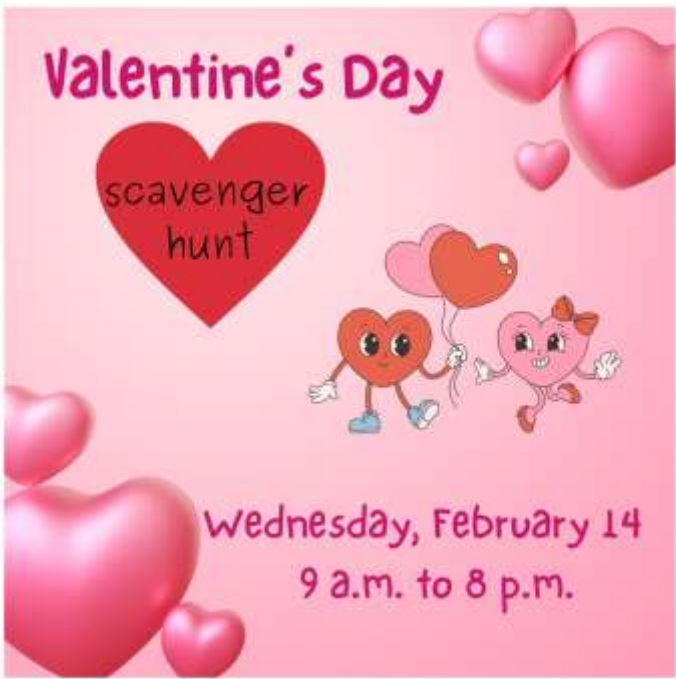
Valentine's Day Scavenger Hunt Attendance: 23