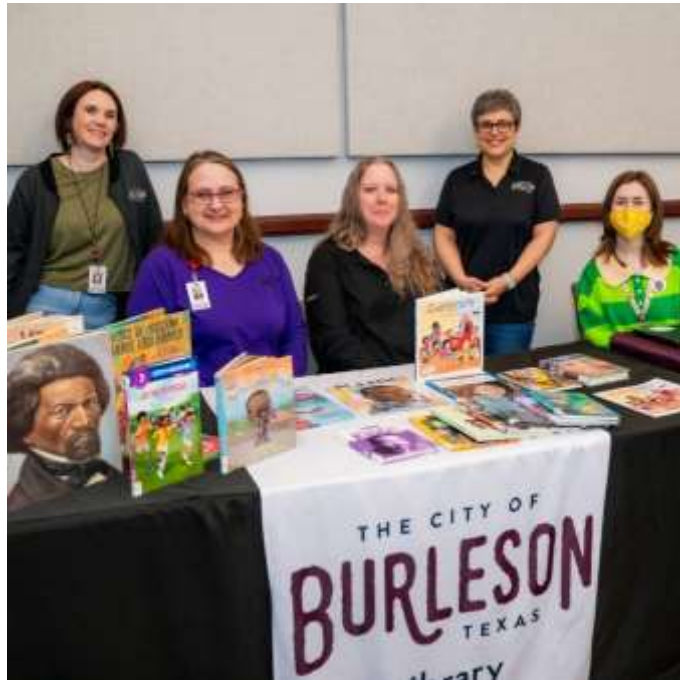
Celebrate Black History Month with Opal Lee