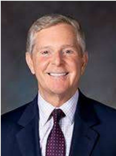
Sen. Phil King - R