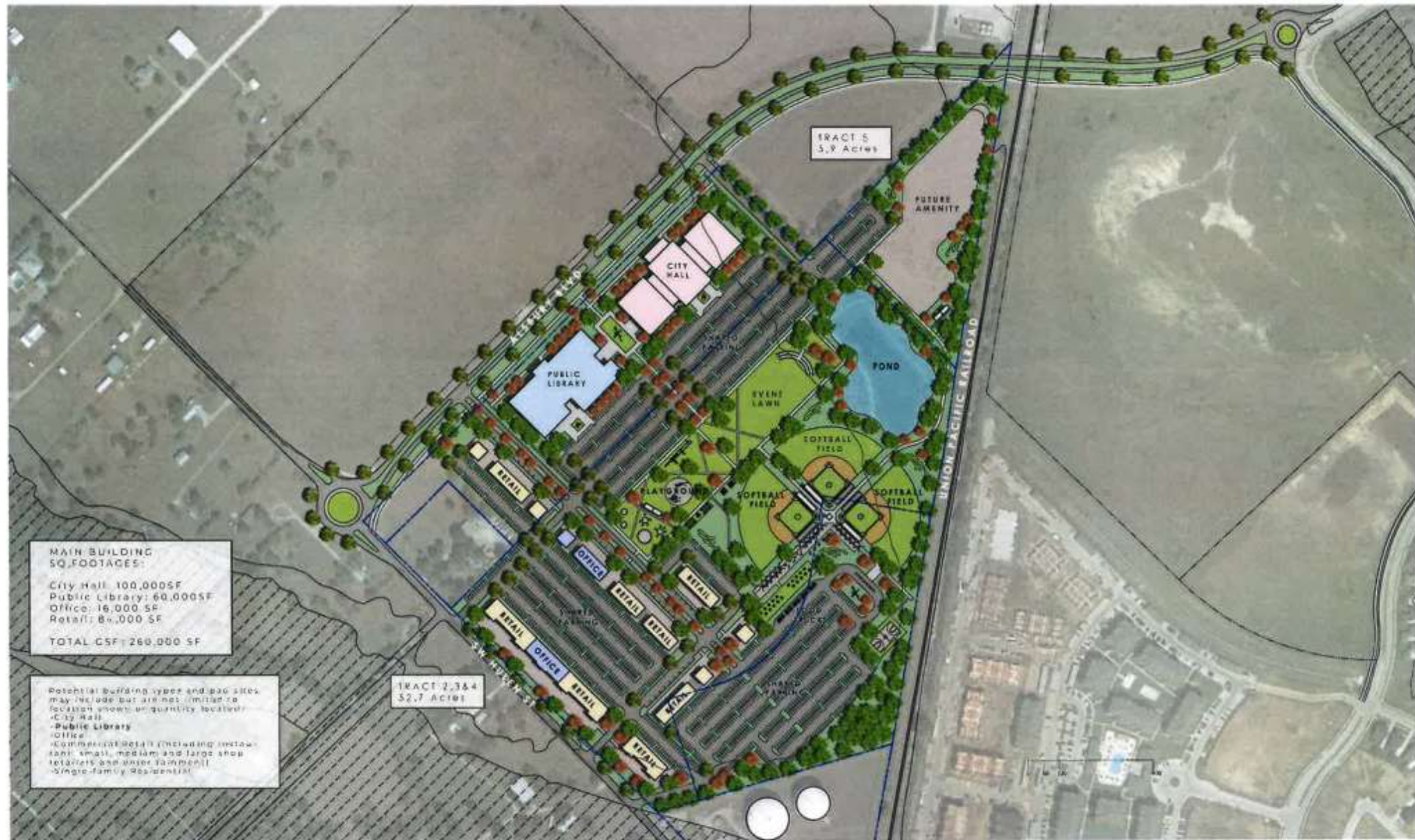
SITE PLAN OPTION 1 | BURLESON WEST TOD MASTER PLAN

FOR CONCEPTUAL USE ONLY. SITE AND IMAGES ARE FOR REPRESENTATION AND INSPIRATION. PLANNED DEVELOPMENT TO BE DELIVERED FOR FUTURE DESIGN.