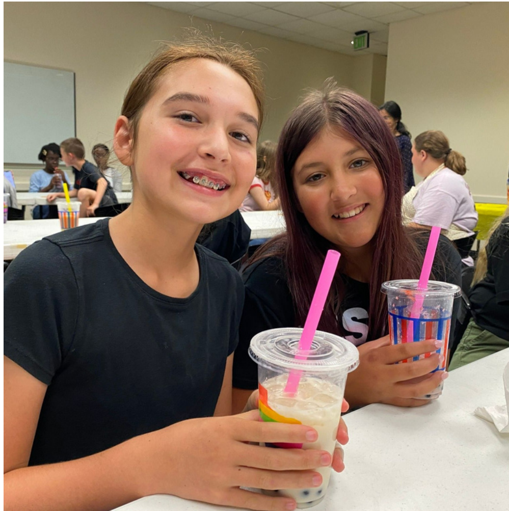
Photo Scavenger Hunt Puppet Karaoke Chopped: Ramen Edition Boba Tea