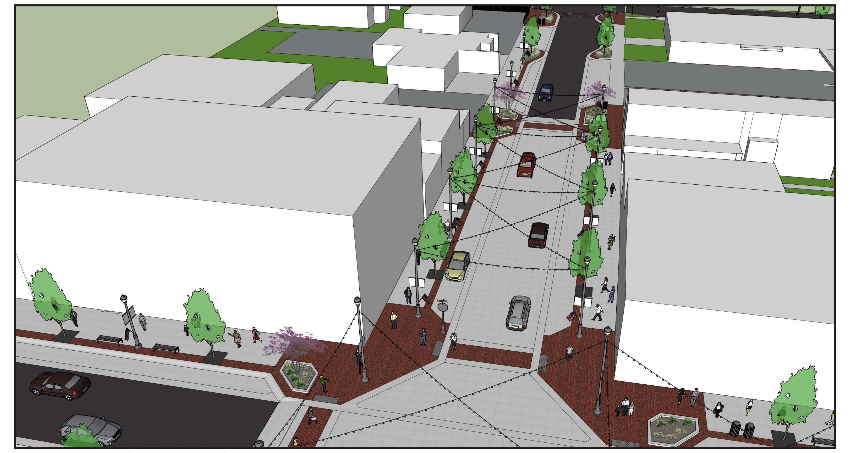
Main St. Aerial View - Looking North