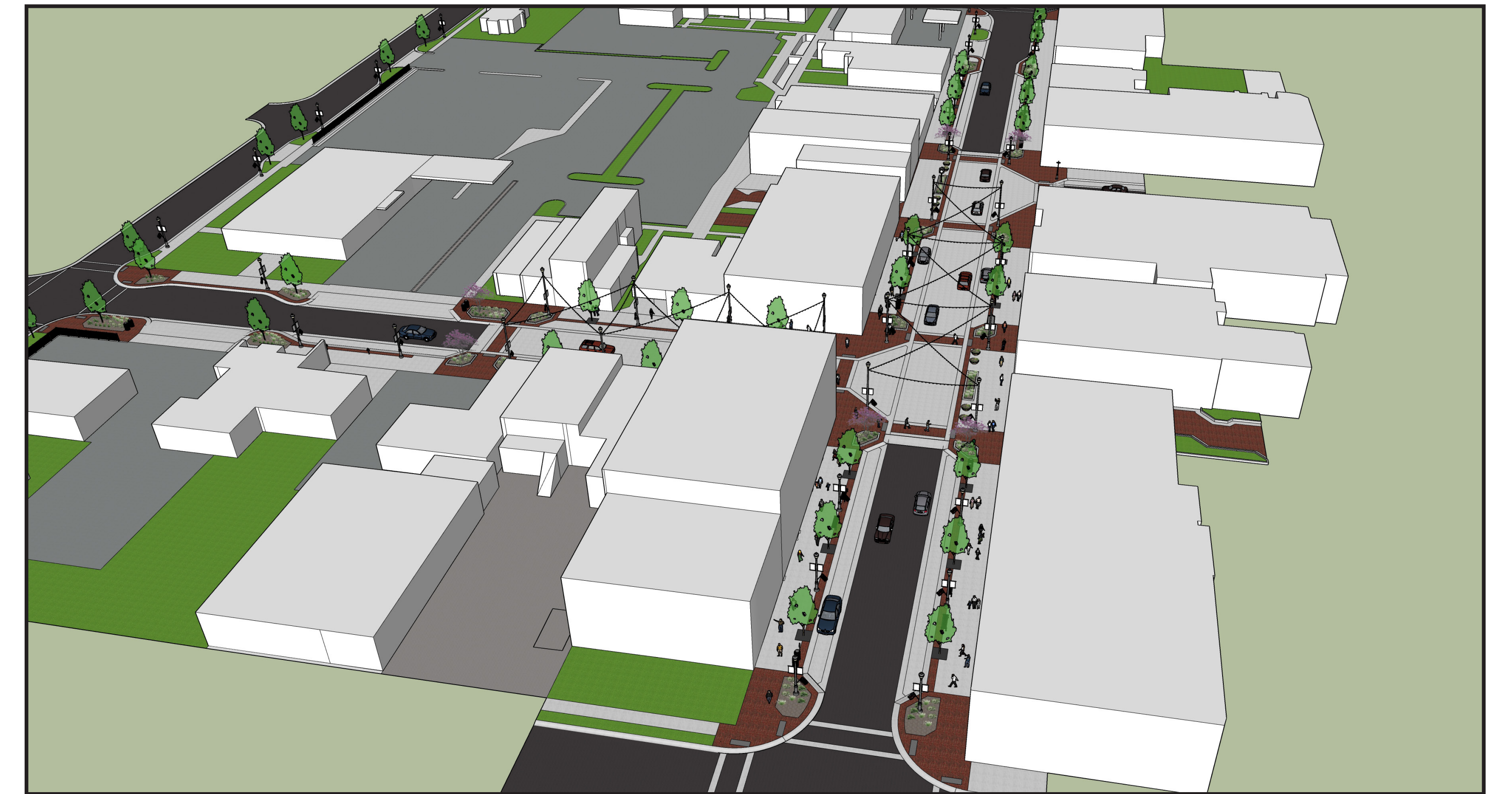
Front St. Aerial View- Looking East