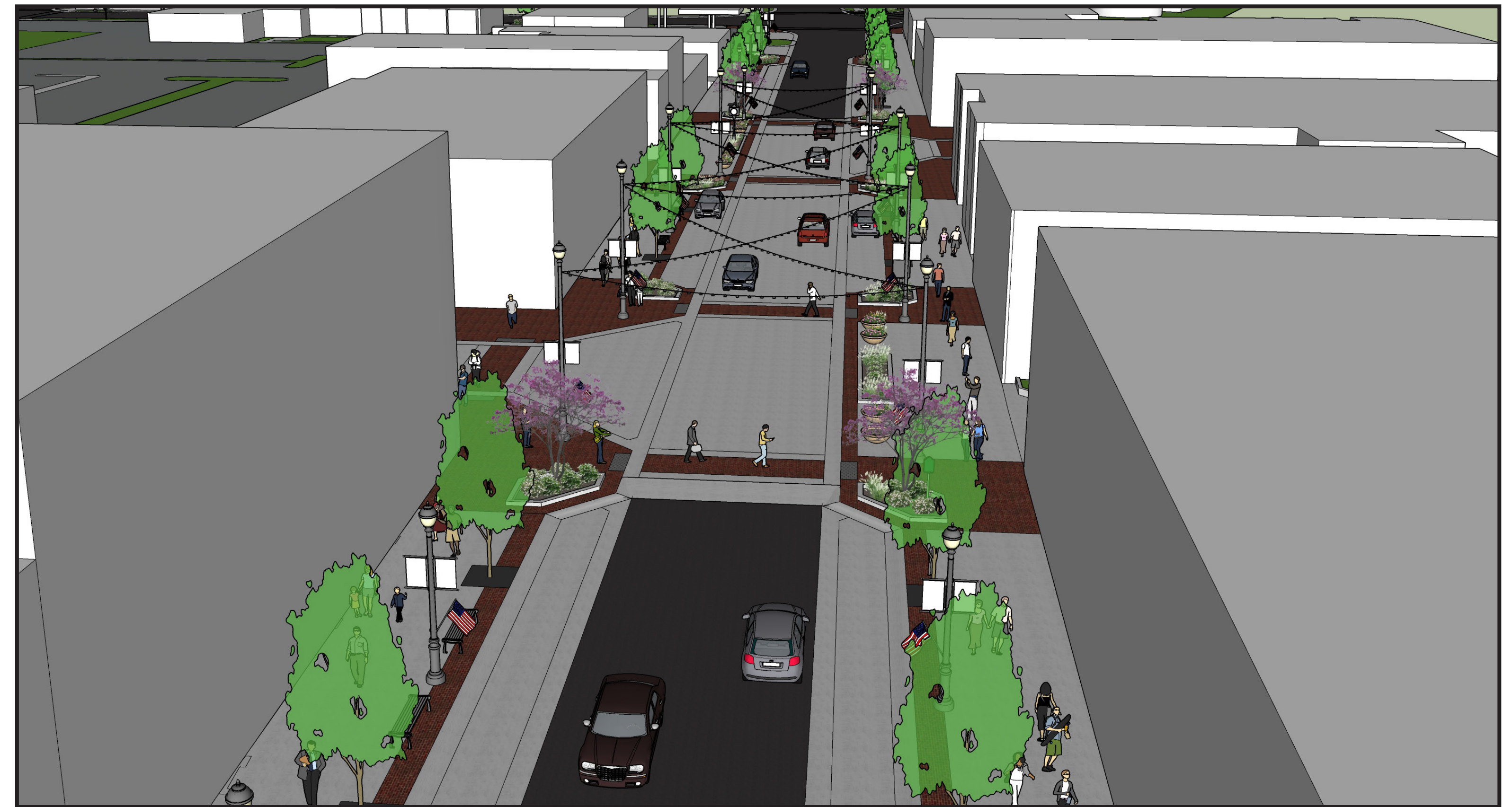
Front St. Aerial View - Looking East