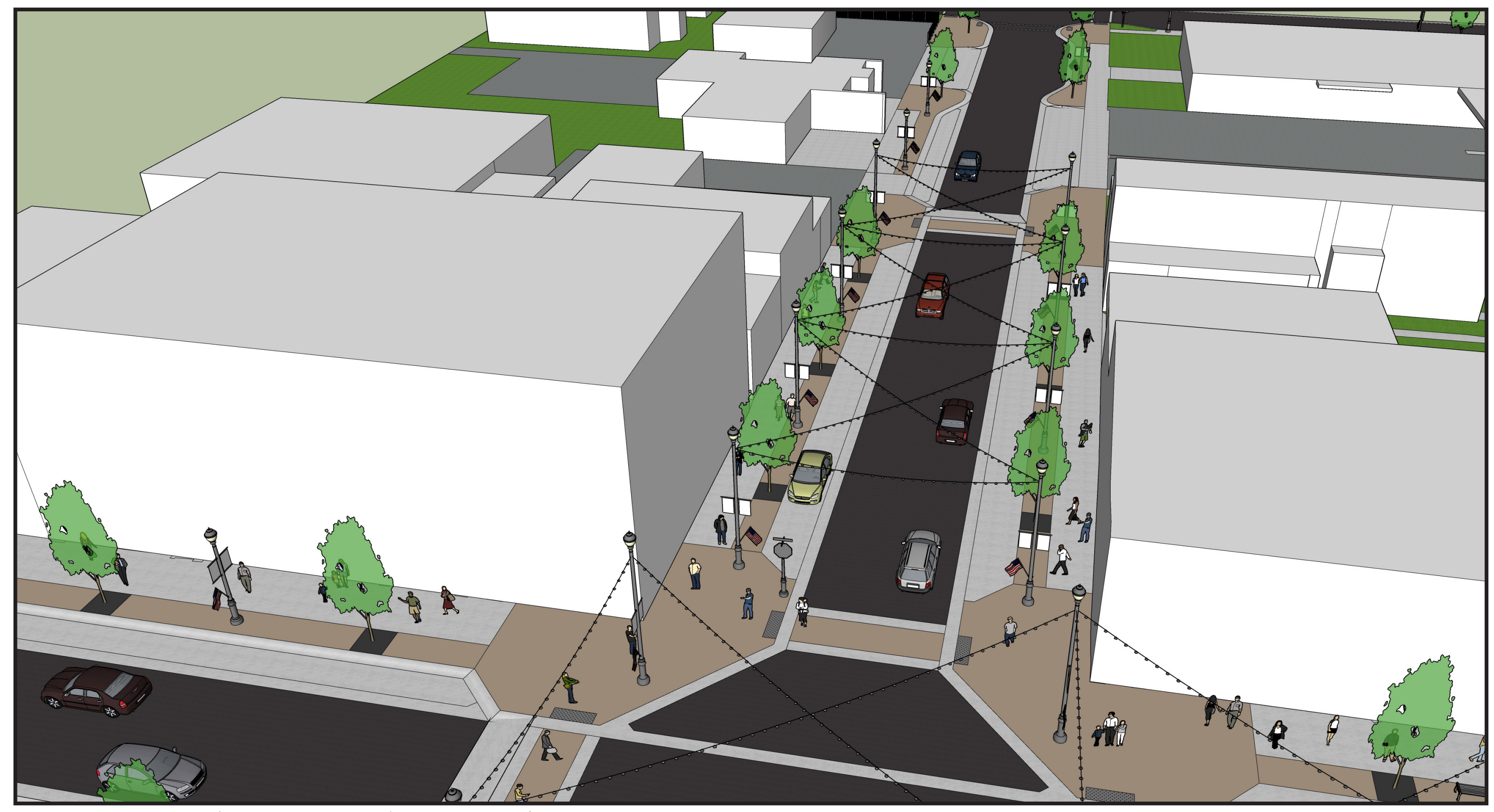
Main St. Aerial View - Looking North