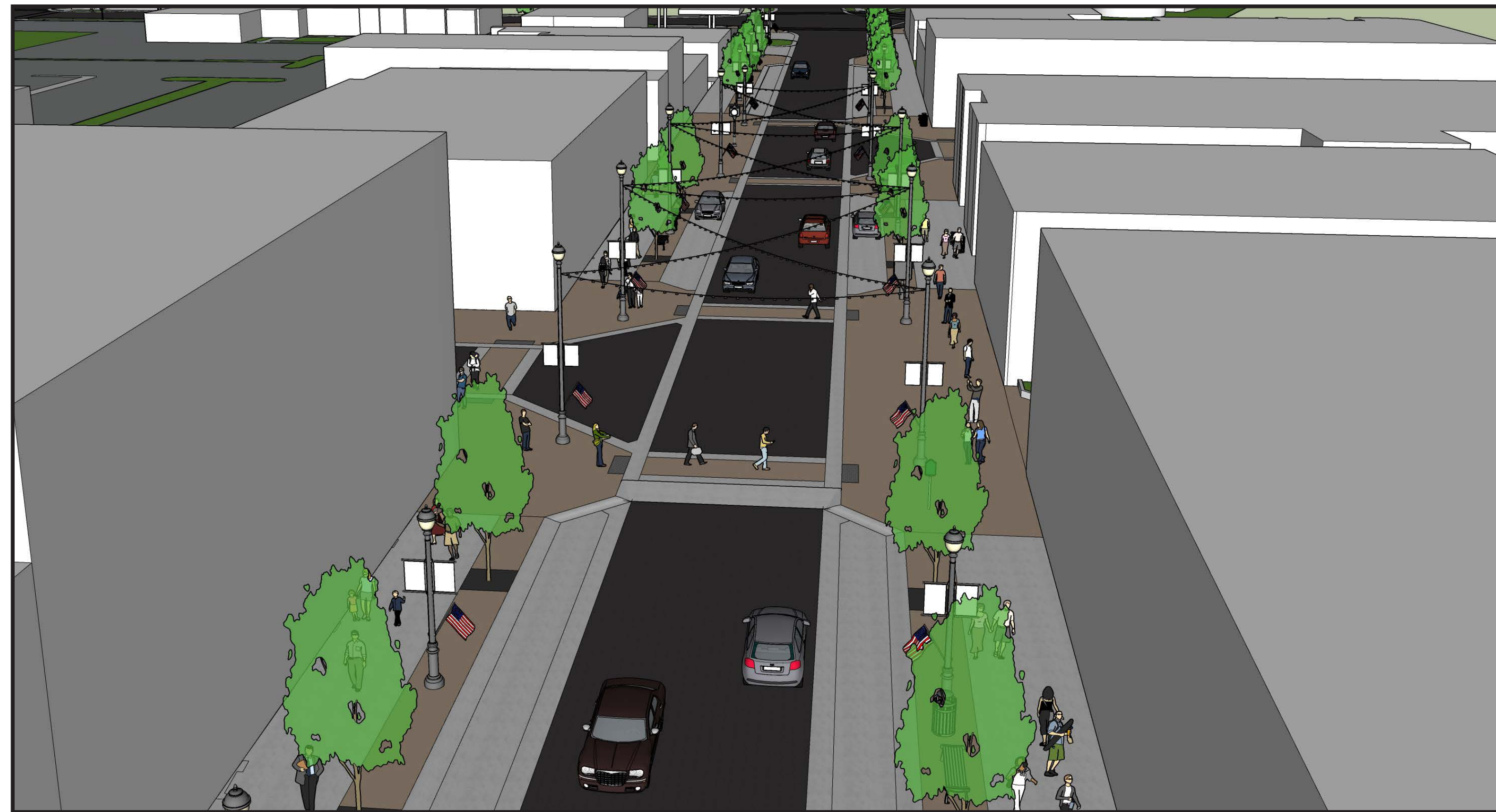
Front St. Aerial View - Looking East