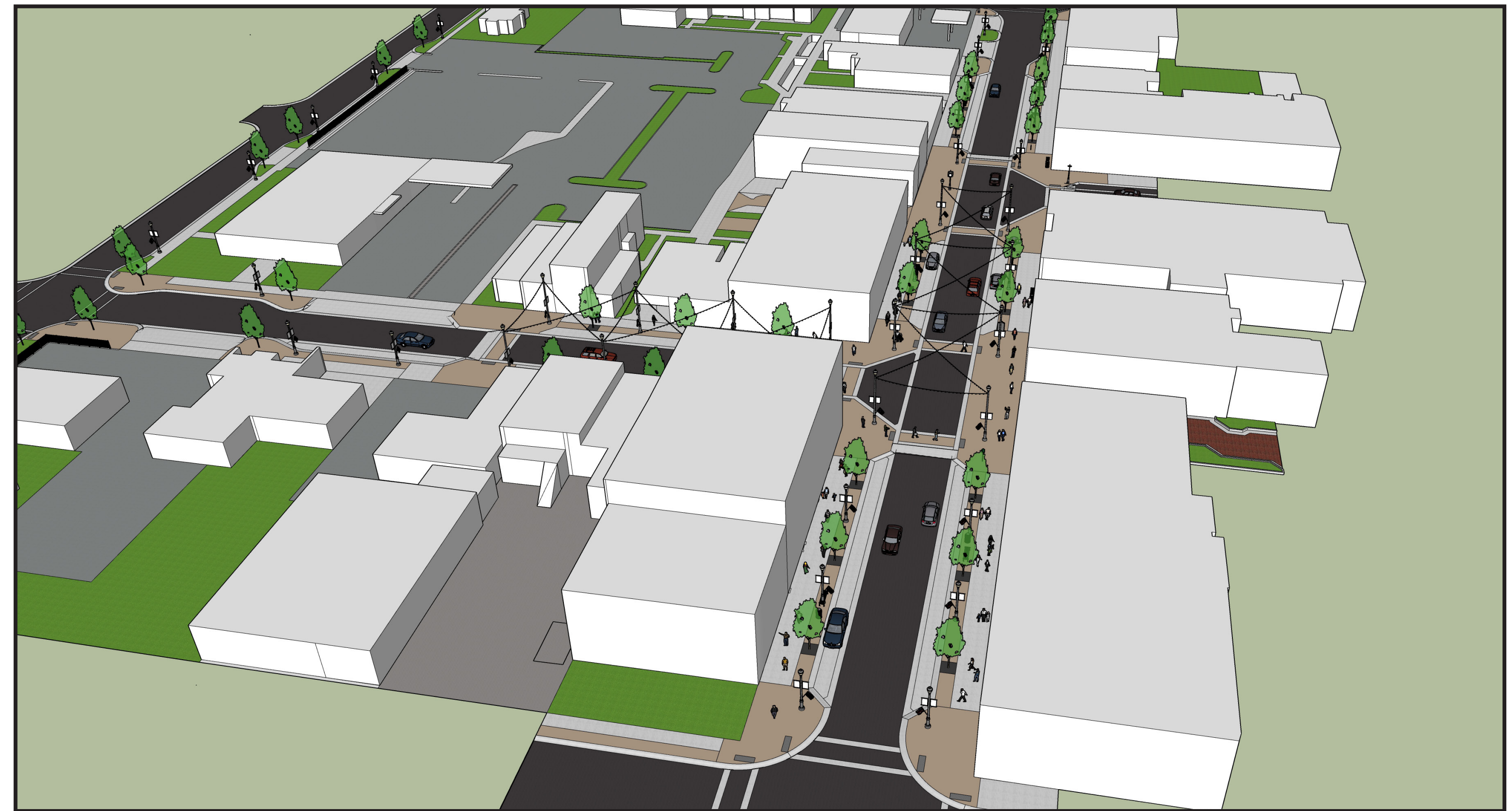
Front St. Aerial View- Looking East