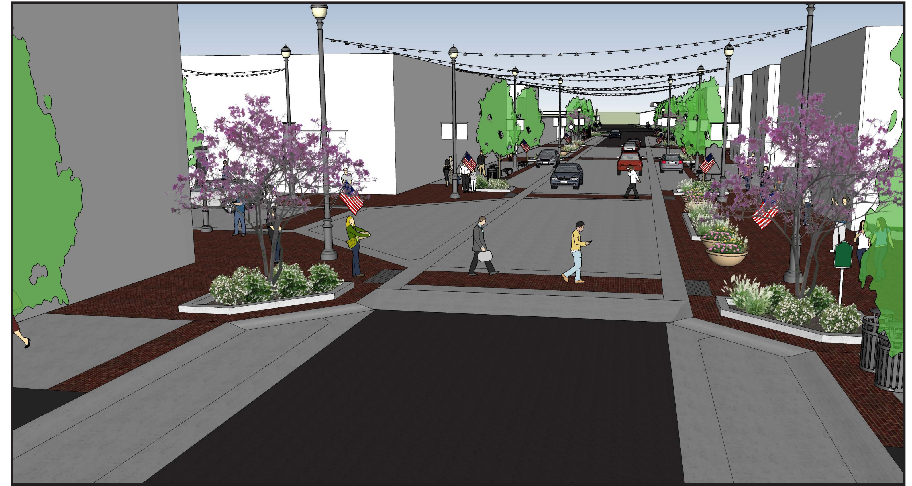
Front St./ Main St. Intersection Street View - Looking East