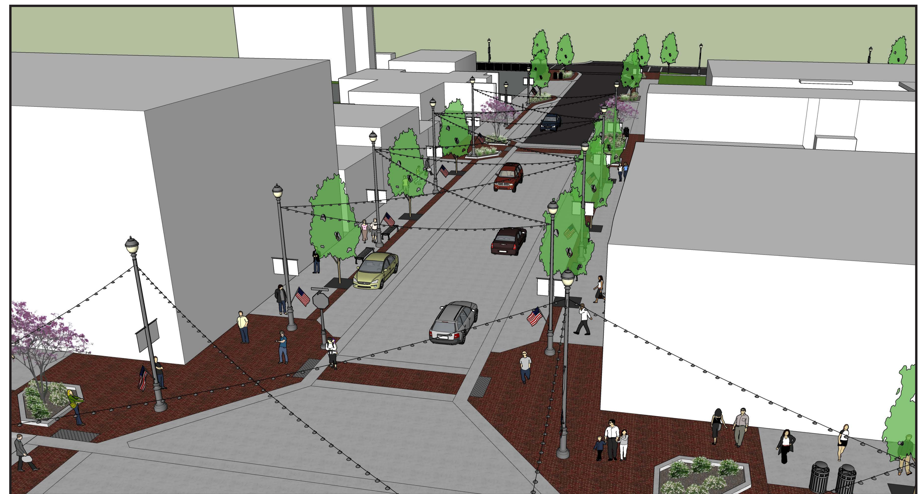
Main St. Aerial View - Looking North