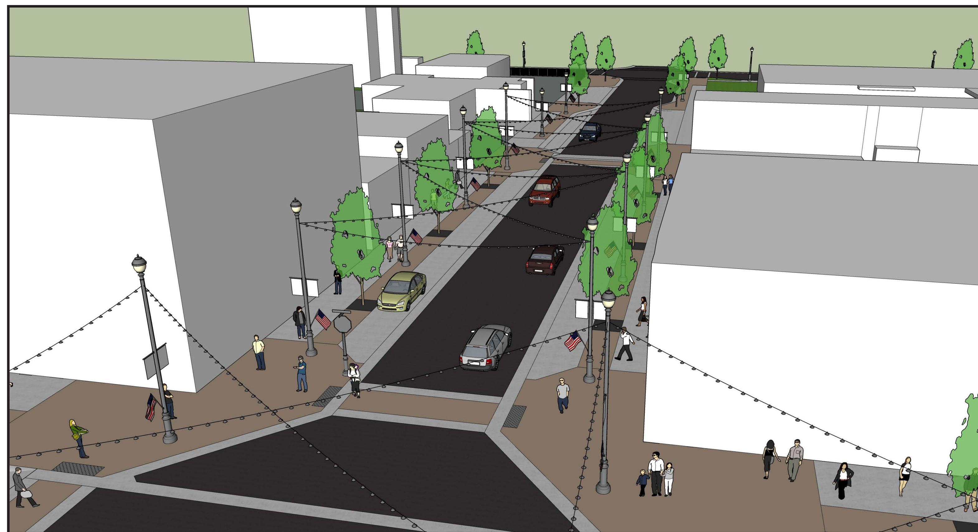
Main St. Aerial View - Looking North