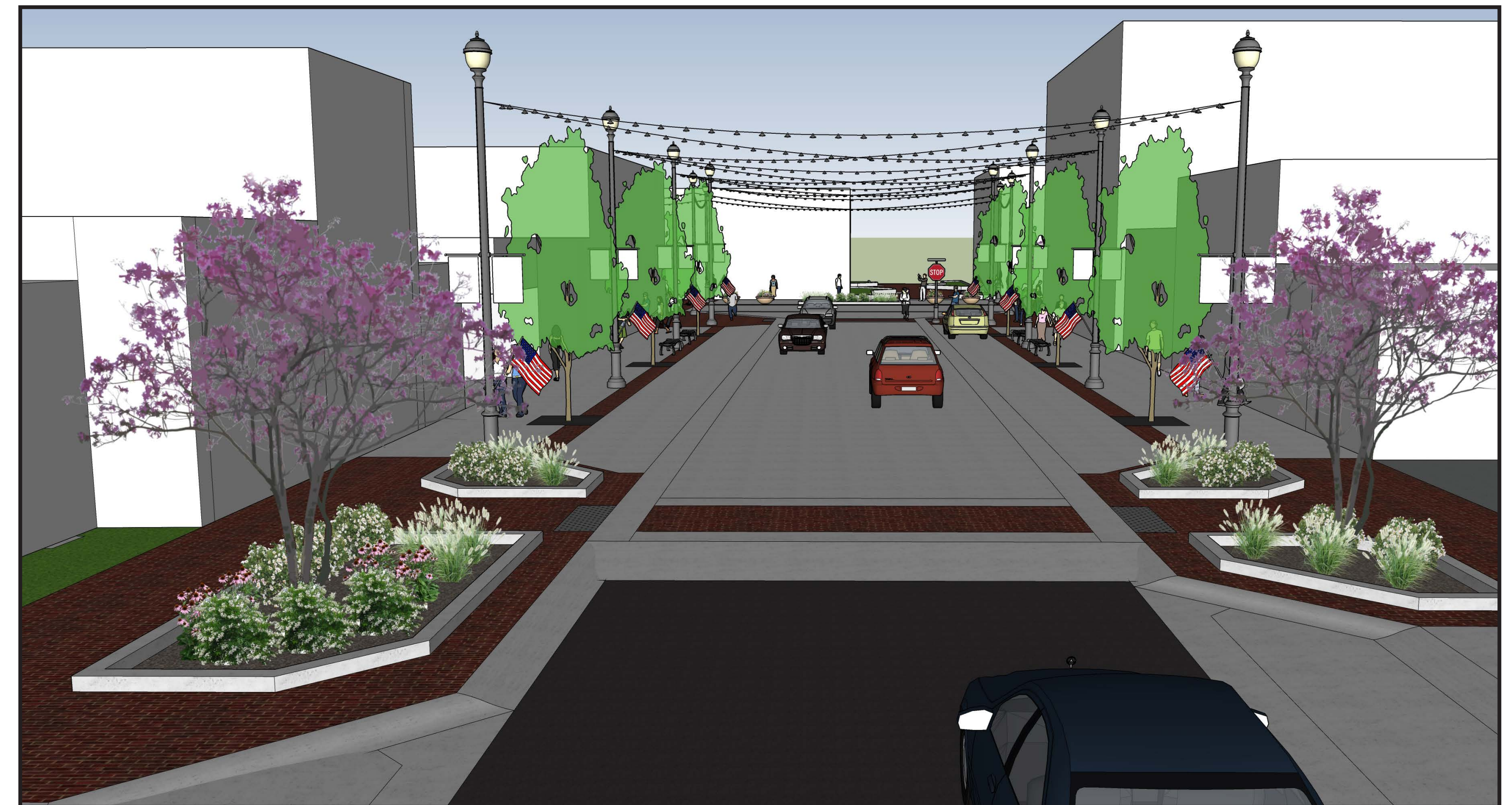
Main St. Crosswalk Street View - Looking South