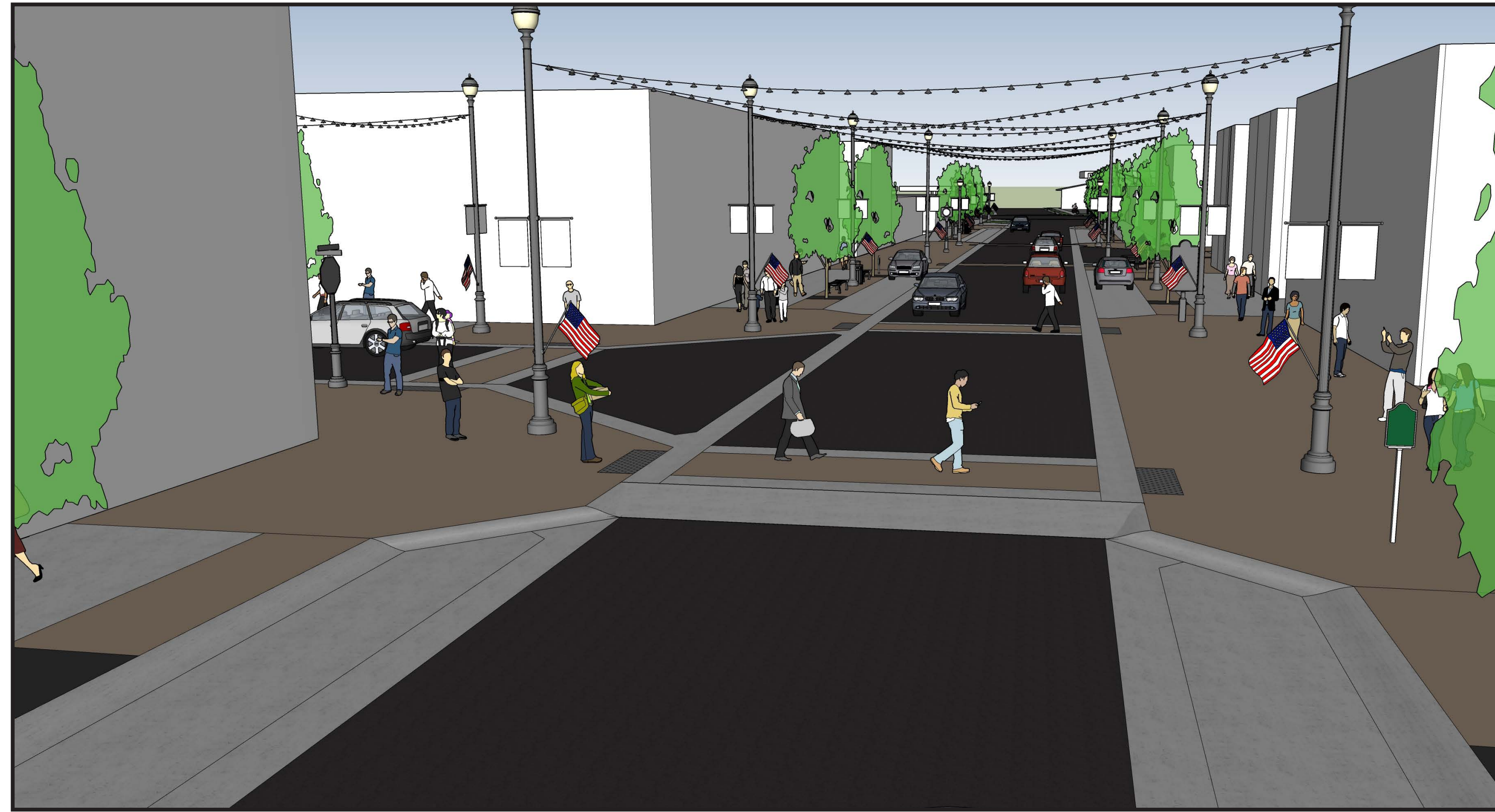
Front St./ Main St. Intersection Street View - Looking East