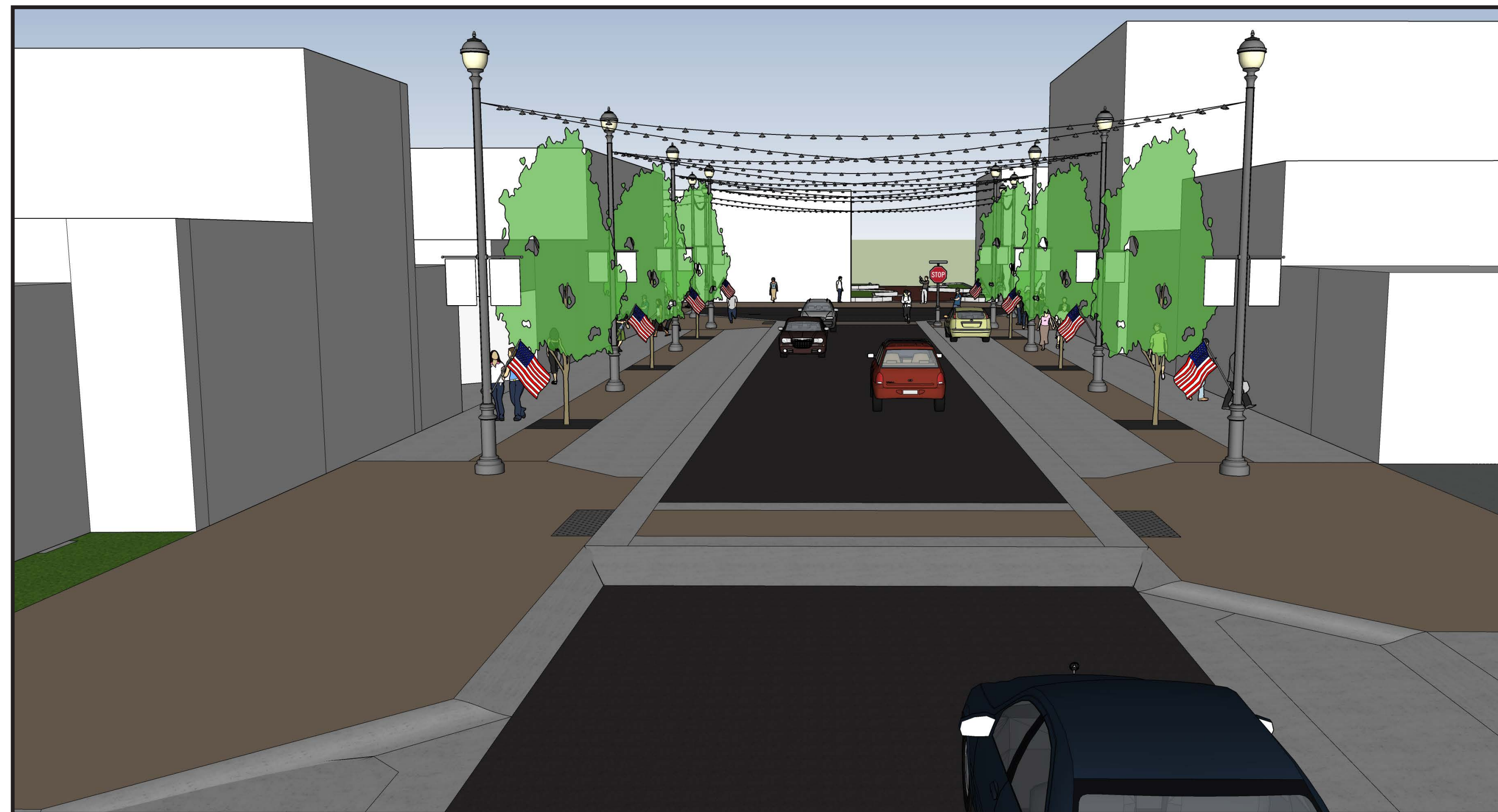
Main St. Crosswalk Street View - Looking South